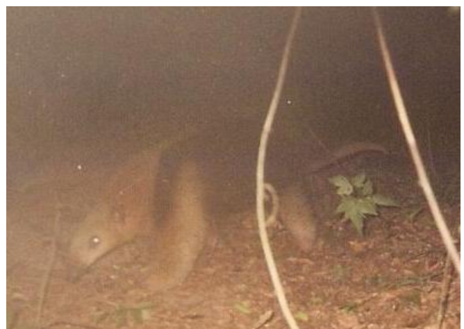
FIGURE 2. Tamandua tetradactyla recorded by camera trap at the coastal plain of the state of Rio Grande do Sul.