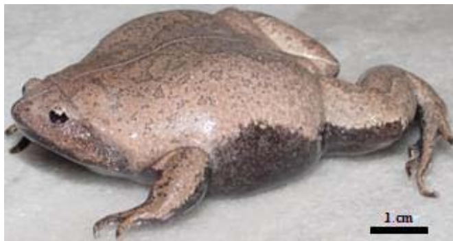
FIGURE 1. Male specimen of Stereocyclops incrassatus (CHBEZ555) obtained at Mata da Cachoeira, Usina Serra Grande, São José da Lage, state of Alagoas, northeastern Brazil.

The EET, located in the municipality of São Lourenço da Mata, has a total area of approximately 800 ha, of which about 400 ha represent forested areas, surrounded by sugarcane monoculture. It consists of three ombrophylous forest fragments: Camucim (200 ha), Alto da Buchada (100 ha) and Toró (100 ha). Five individuals of S. incrassatus were captured with pitfall traps in the Camucim fragment, and were deposited in the Herpetological Collection of the Universidade Federal do Rio Grande do Norte - CHBEZ/UFRN (CHBEZ2810 - 2814). The individuals were found between May and July 2008 (rainy season), a fact that is to be expected since most tropical frogs, especially those with explosive reproduction such as S. incrassatus and