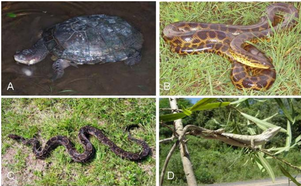
Figure 4. Species of reptiles which should be protected: A) Acanthochelys pallidipectoris ; B) Eunectes notaeus ; C) Boa constrictor occidentalis ; D) Polychrus acutirostris.