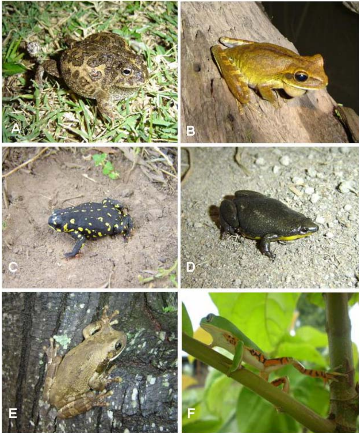
Figure 2. Representatives of some of the amphibians recorded at the Oriental Chaco: A) Odontophrynus americanus ; B) Hypsiboas raniceps ; C) Melanophryniscus klappenbachi ; D) Elachistocleis bicolor ; E) Trachycephalus venulosus ; F) Phyllomedusa azurea .