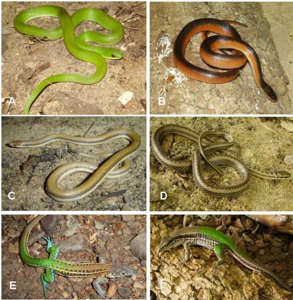
Figure 3. Representatives of some of the reptiles recorded at the Oriental Chaco: A) Liophis guentheri (photo by C. C. Calamante); B) Clelia bicolor (photo by C. C. Calamante); C) Phimophis vittatus (photo by V. H. Zaracho); D) Echinanthera occipitalis (photo by C. C. Calamante); E) Teius teyou (photo by V. H. Zaracho); F) Ameiva ameiva (photo by C. C. Calamante).