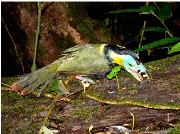
Figure 4. Selenidera maculirostris is an endemic species of Atlantic forest occurring at Ilha Grande, state of Rio de Janeiro, Brazil.

most frequently captured in the understory of the least disturbed forest during these systematic long-term studies (Alves 2001; Alves 2007). This kind of data allows evaluations of the population numbers over the years and between years (Alves 2007). Other species frequently captured and recorded based on sightings or vocalizations were Chiroxiphia caudata (Shaw & Nodder, 1793) and Trichothraupis melanops (Vieillot, 1818). One example of a species not regularly recorded is Haplospiza unicolor Cabanis, 1851, captured only six years after starting our mist netting study (Alves 2007). This last species is endemic of Atlantic forest, feeds on bamboo seeds, and is usually detected during the flowering and fructification of these plants (Olmos 1996b). Species eventually captured but with no visual or vocal record were Pionopsitta pileata (Scopoli, 1769), Elaenia mesoleuca (Deppe, 1830) and Phyllomyias fasciatus (Thunberg, 1822). We did not record any species based only on vocal record, except Grallaria varia (Boddaert, 1783), and Nyctibius griseus (Gmelin, 1789), which we have no doubt in terms of vocal identification.