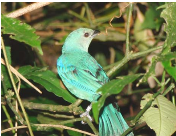
Figure 2. Thraupis cyanoptera is an endemic species of Atlantic forest occurring at Ilha Grande, state of Rio de Janeiro, Brazil.

A total of 175 bird species were encountered at Ilha Grande during the primary surveys. An additional 47 species were obtained from secondary data from other authors (Maciel et al. 1984; Maciel and Pacheco 1995; Coelho et al. 1991; Pacheco et al. 1997; Buzzetti 2000; Raposo et al. unpublished data; Maciel unpublished data), including data from other locations at Ilha Grande besides the ones we sampled (Table 1). This represents 222 bird species from 58 families.