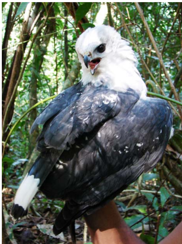
Figure 5. Leucopternis lacernulatus is a threatened and endemic bird of Atlantic forest at Ilha Grande, state of Rio de Janeiro, Brazil.

rhodocorytha ) and four were recorded only at Ilha de São Sebastião [ Pipile jacutinga (Spix, 1825), Touit surdus (Kuhl, 1820), Myrmotherula minor Salvadori, 1864 and Neopelma chrysolophum Pinto, 1944].