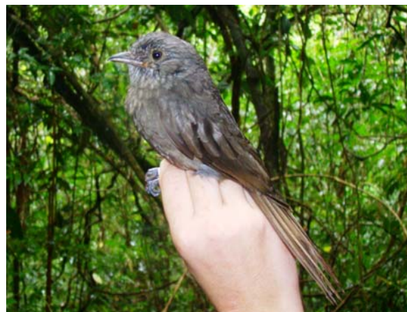
Figure 3. Lipaugus lanioides is an endemic species of Atlantic forest occurring at Ilha Grande, state of Rio de Janeiro, Brazil.

Atlantic forest remnants at Ilha Grande, as well as Itatiaia (states of Rio de Janeiro and Minas Gerais), can be two remarkable Atlantic forest remnants for Pyroderus scutatus , whose populations are much reduced in Southeast Brazil (Sick 1997).