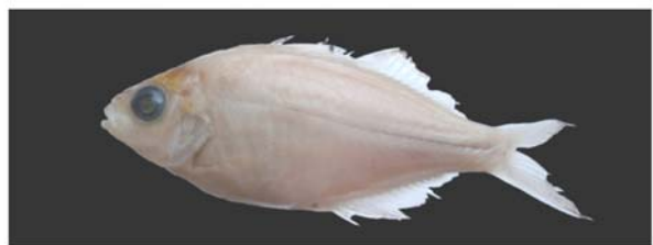
Figure 21. Parambasis sp. 1