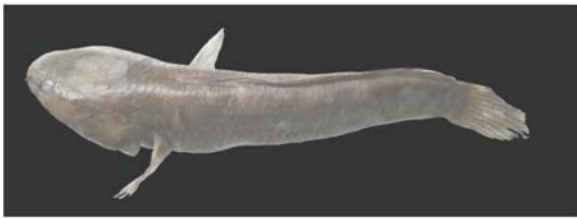
Figure 26. Channa sp. 1