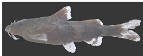
Figure 19. Pseudolaguvia sp. 2