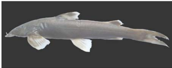
Figure 16. Glyptothorax sp. 3