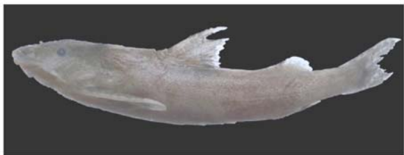
Figure 20. Pseudolaguvia sp. 3