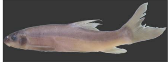
Figure 3. Schizothorax sp. 1