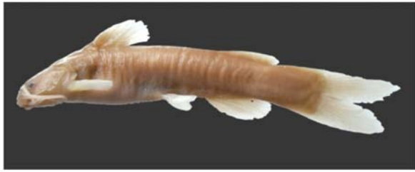
Figure 12. Amblyceps sp. 1