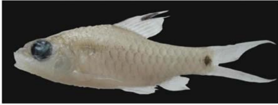
Figure 2. Oreichthys sp. 1