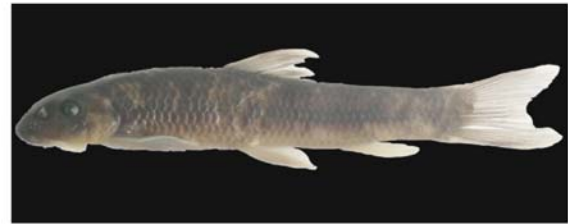
Figure 5. Garra sp. 1