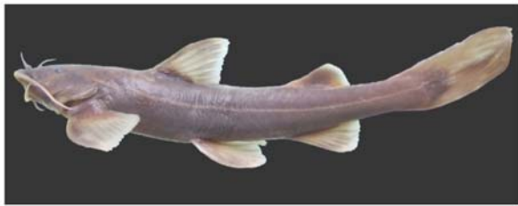
Figure 14. Glyptothorax sp. 1