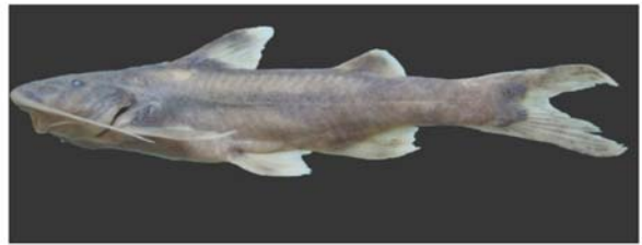
Figure 15. Glyptothorax sp. 2