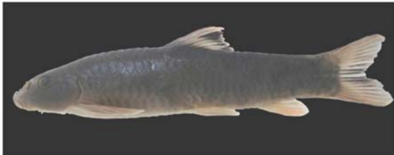
Figure 6. Garra sp. 2