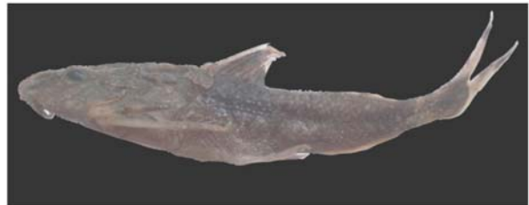
Figure 17. Hara sp. 1