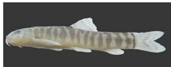
Figure 10. Physoschistura sp. 1