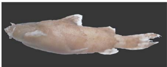
Figure 18. Pseudolaguvia sp. 1