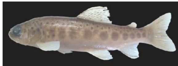
Figure 28. Oncorhynchus mykiss