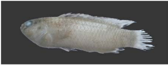
Figure 24. Badis sp. 2