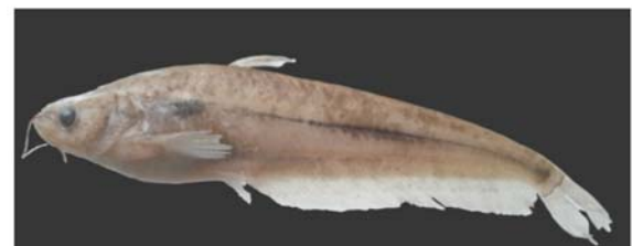
Figure 11. Ompak sp. 1