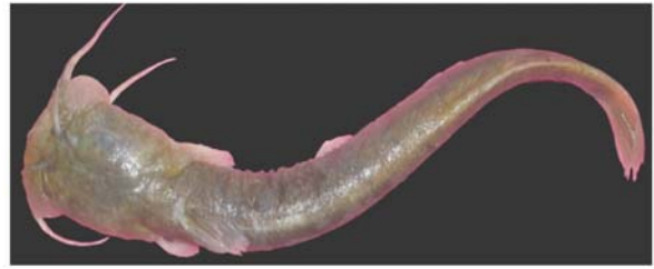
Figure 13. Amblyceps sp. 2