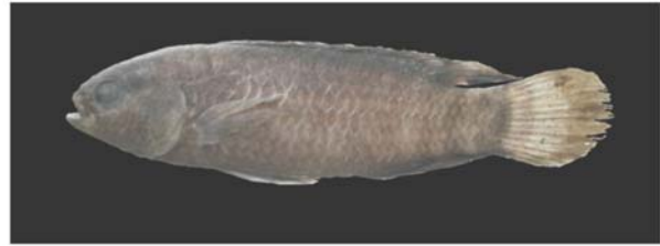
Figure 23. Badis sp. 1