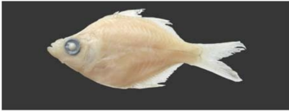
Figure 22. Parambasis sp. 2