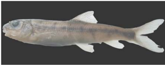
Figure 4. Schizothorax sp. 2