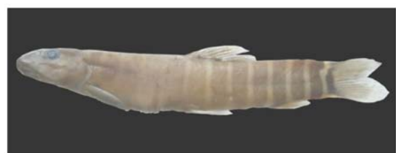
Figure 9. Schistura sp. 2