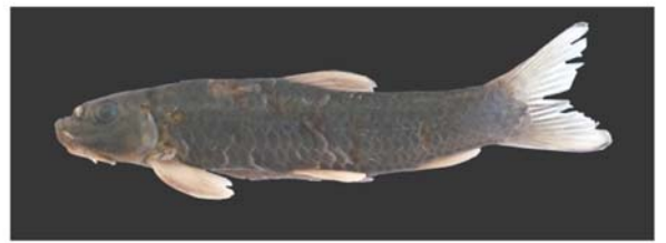
Figure 27. Garra kalpangii sp. nov.