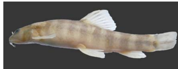
Figure 8. Schistura sp. 1