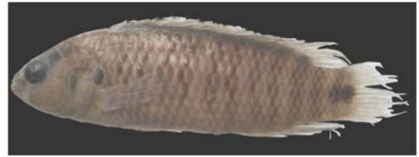
Figure 25. Badis sp. 3