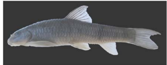
Figure 7. Garra sp. 3