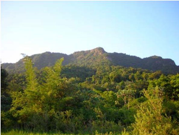
Figure 2. View of the Tres Candú hill, Ybyturuzú mountain systems, Paraguay.

The Pirapo'i stream is a tributary of the Tebicuary-mi River that originates on the slopes of Tres Candú hill (842 m a.s.l.), in the Ybyturuzú mountain systems (Figure 2). This region belongs to the Atlantic Forest ecoregion (Dinerstein et al. 1995; Olson et al. 2001).