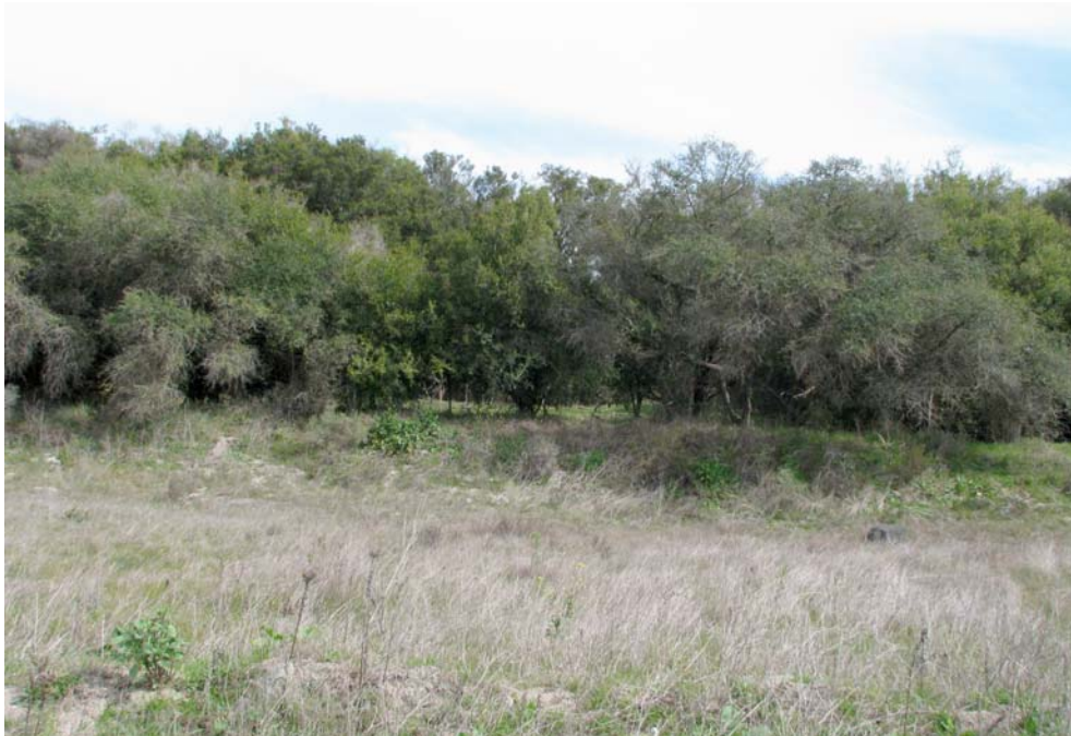
Figure 2. Habitat of T. poecilopogon near “Parque Costero del Sur” biosphere reserve, Partido de Magdalena, Buenos Aires province, Argentina.