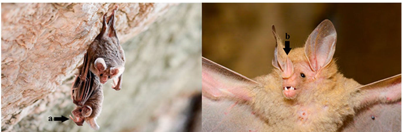
Figure 3. Chrotopterus auritus photographed at the Gruta Três Inchu, Martins municipality, Rio Grande do Norte state, northeast Brazil. Note the long thumb (arrow a) with a large strongly curved claw and the cup-shaped horseshoe of noseleaf (arrow b).

The presence of C. auritus within the Caatinga may be unusual, since there are only 6 previous records from this biome (Fig. 1; Table 1). The records are: in xeric-woodlands of Caatinga (SÁ-NETO & MARINHO-FILHO 2013); in Chapada Diamantina National Park in Bahia state (GREGORIN & MENDES 1999; SBRAGIA & CARDOSO 2008); in transition areas of Caatinga and the Amazon (UIEDA et al. 1980); in humid forest enclaves within the Caatinga known as “Brejos de Altitude” (SOUSA et al. 2004); and in the southern limit of the Caatinga in Jaíba, northern Minas Gerais state (NOGUEIRA et al. 2015). Moreover, 4 of these records were obtained from underground cavities (GREGORIN & MENDES 1999; SBRAGIA &