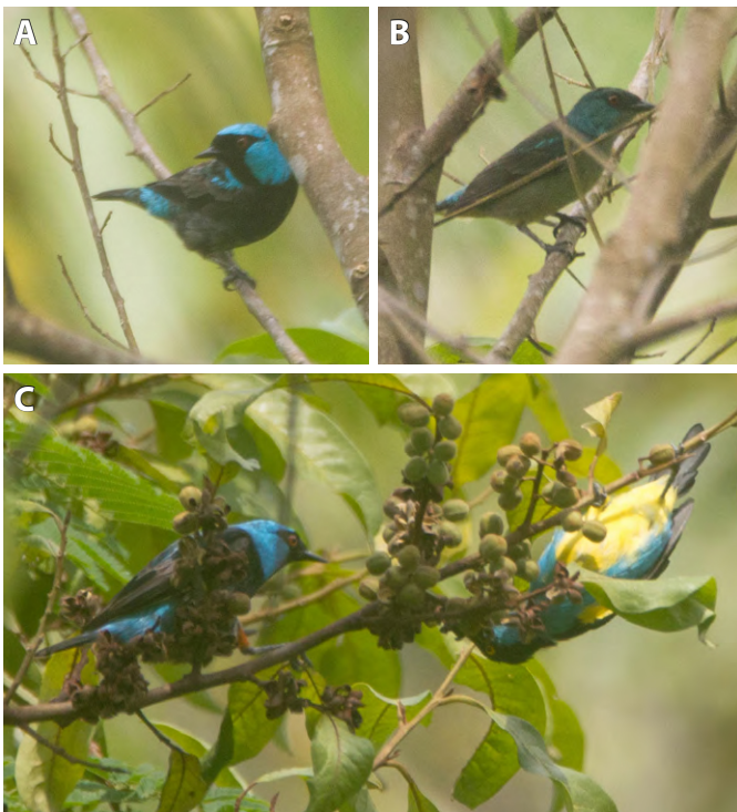
Figure 2. Individuals of the Scarlet-thighed Dacnis from Betulia, Santander. A. Male. B. Female. C. Scarlet-thighed Dacnis and Black-faced Dacnis ( D. lineata ) feeding on the same tree ( Laetia sp.).

especialmente a lo largo de la Serranía de la Paz, una montaña que ha sido poco estudiada (DONEGAN et al. 2010), y que tiene muchas áreas de bosque con condiciones similares a la descrita aquí. Es posible encontrar la especie en las faldas del Parque Nacional Serranía de los Yariguíes, donde la vegetación está en mejores condiciones. La especie no fue registrada en ninguna de las otras localidades del proyecto de monitoreo, lo que sugiere que D. venusta es poco común aquí y que probablemente no ha cruzado la Serranía de la Paz. El Scarlet-thighed Dacnis puede estar mostrando una extensión de rango similar, como lo es el endémico y vulnerable Turquesa Dacnis [ Dacnis hartlaubi (Sclater, 1855)] (RENJIFO et al. 2014), que tuvo una distribución localizada en Colombia (HILTY & BROWN 1986) pero en décadas recientes ha aumentado el número de registros, ya que nuevas poblaciones fueron documentadas a lo largo de las Cordilleras Central y Oriental y el valle de Magdalena (STILES et al. 1999; DONEGAN et al. 2007). Sugiero que la especie de Dacnis podría estar siguiendo la deforestación, rastreando los límites del bosque, claros y plantaciones de café dispersas (ORREGO et al. 2002; RENJIFO et al. 2002).