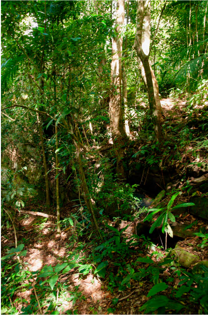
Figure 2. Habitat where the specimens were found. Bananal, Rio de Janeiro state, Brazil.

closed canopy and sparse of undergrowth. The ground was covered by wet leaf litter with decaying wood (Fig. 2); the whole area was rocky and the terrain was often very steep.