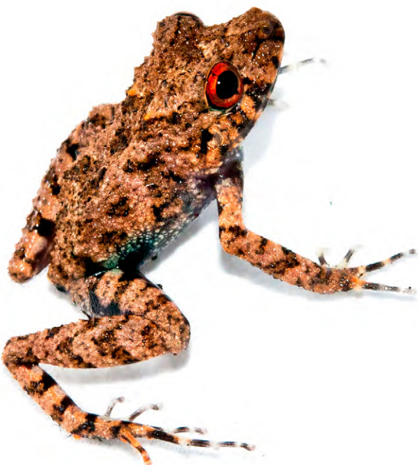
Figure 1. One of the specimens of Ischnocnema octavioi .

The transect started on the edge of the forest and continued inward, crossing one larger (5 m wide) and several smaller (1 m wide) streams. The forest supported high tree density with