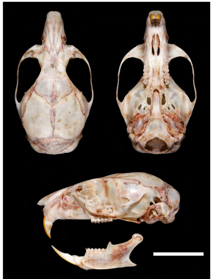
Figures 1–3. Specimen of Rhagomys longilingua (MUSA 13453) collected in Santa Rita Alta, Huallaga River, Peru. 1. External morphology of the living individual. 2. Diagnostic characters of manus and pes (pads and claws). 3. Dorsal, ventral and lateral views of cranium and mandible, scale bar equal to 10 mm.