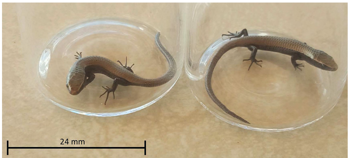
Figure 3. Hatchling Gymnophthalmus underwoodi specimens collected for analysis.

Genomic DNA was extracted from a small piece of tail from specimen #6432 preserved in 95% ethanol using a DNeasy Blood and Tissue Kit (Qiagen, Inc.). Purified DNA was then PCR amplified at 1 mitochondrial (16S) and 1 nuclear ( c-mos ) locus. A 500 base pair fragment of 16S rDNA was generated using the primers 16Sar and 16Sbr (PALUMBI et al. 1991, GenBank accession number KX66265) and a 390 base pair fragment of the nuclear gene c-mos was generated using the primers G73d and G74d (SAINT et al. 1998, GenBank accession number KX66266). Forward and reverse sequences were aligned and edited in BioEdit (HALL 1999) and MEGA 6 (TAMURA et al.