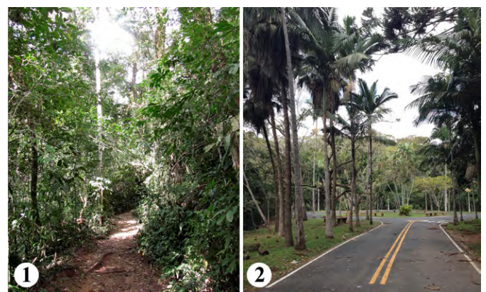
Figures 1 and 2. The collection site of this study, Recanto das Cigarras in Universidade Federal de Viçosa, Minas Gerais (Brazil). 1. The main trail. 2. The entrance of the trail.

We surveyed an Atlantic Forest area, known as Recanto das Cigarras (Figure 1), situated in the Campus of the Universidade Federal de Viçosa, in Minas Gerais state (Brazil) (Figure 2). The vegetation along the main trail “Mata da Biologia” was examined in search for the host plant and insect galls. The geographic coordinates and altitude of the beginning and the end of the trail were obtained using GPS (datum: SIRGAS2000) (20°45'24" S, 042°51'39" W, altitude: 699 m; 20°45'21" S, 042°51'28" W, altitude: 729 m). The map was made based on an original map from IBGE (2015).