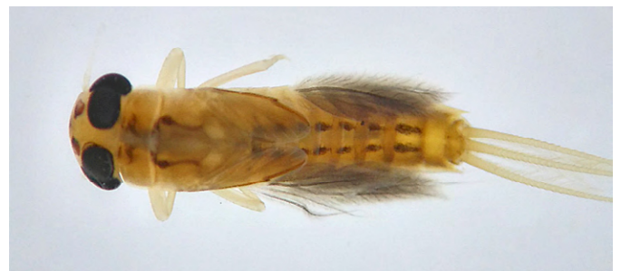
Figure 7. Nymph of Tikuna bilineata (dorsal view).

Examined material. One male (UFRR 134) and one female adults (UFRR 135), Brazil, Tocantins state, Palmas, district of Taquaruçu, Evilson waterfall, 21–25.III.2016, T.K. Krolow col.