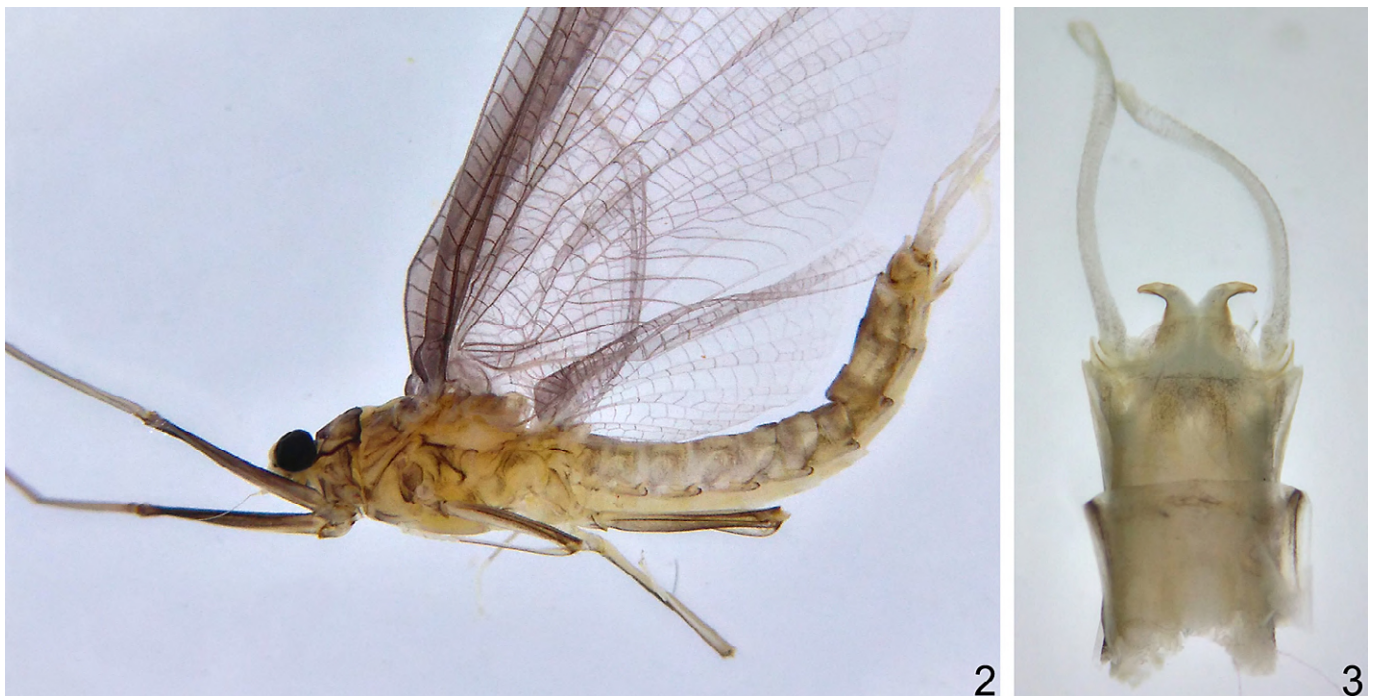
Figures 2, 3. Campylocia demoulini . 2. Male imago, lateral view. 3. Genitalia (ventral view).

Examined material. One male imago (UFRR 131), Brazil, Tocantins state, Palmas, district of Taquaruçu, Evilson waterfall, 21–25.III.2016, T.K. Krolow col.