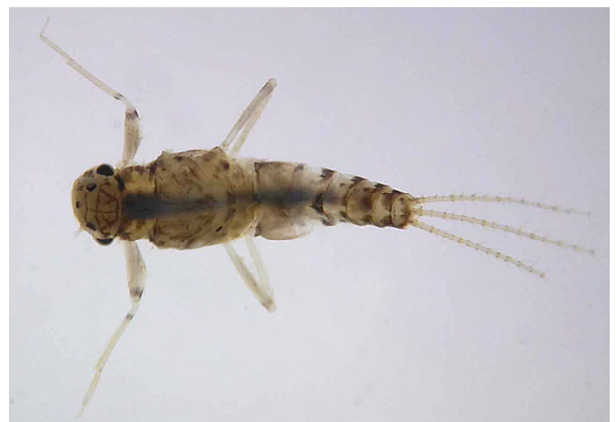
Figure 4. Nymph of Amanahyphes bahiensis (dorsal view).

Diagnosis. Male imago: 1) femoral spines long, slender and acuminate; tarsal claws with 10–11 marginal denticles and 2+3 subapical submarginal denticles; 2) gill formula (number of lamellae per gill) 3/2/2/2.