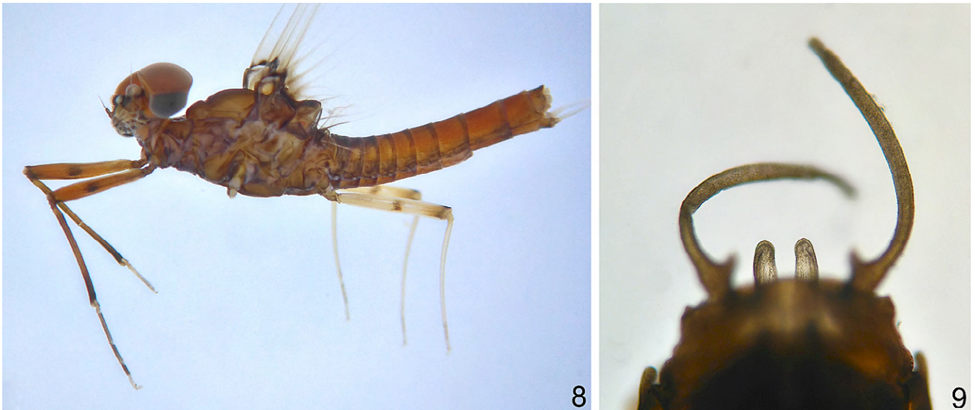
Figures 8, 9. Ulmeritoides flavopedes . 8. Male imago, lateral view. 9. Genitalia (ventral view).

Diagnosis. Male imago: 1) Membrane of fore wing hyaline, wing bases brown; 2) apex of penis lobes rounded, each with a lateral groove; 3) abdominal terga orange-brown, posterior margins blackish.