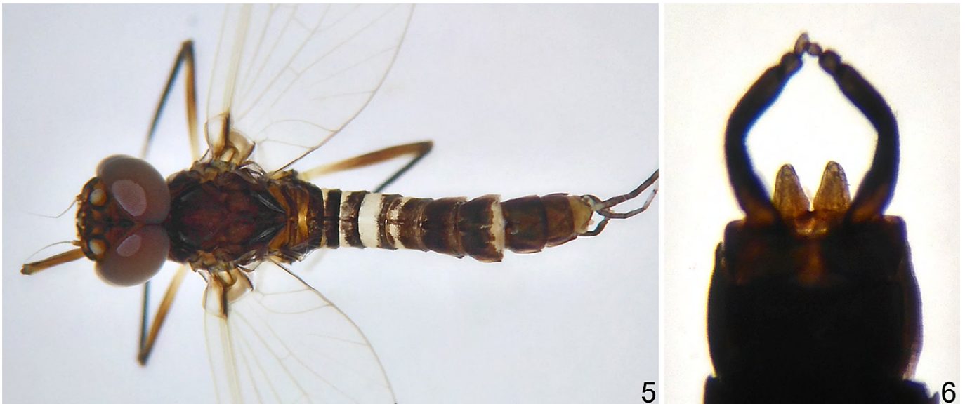
Figures 5, 6. Simothraulopsis demerara . 5. Male imago (dorsal view). 6. Male genitalia (ventral view).

Previous distribution. Brazil: state of Bahia (MOLINERI et al. 2015).