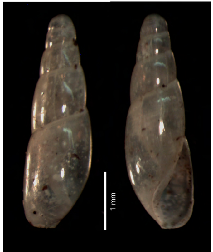
Figure 2. Cecilioides acicula collected in sediments from a grave at the Municipal Cemetery of La Plata, Buenos Aires province, Argentina (MLP-Ma 14219).

Cecilioides consobrina (d'Orbigny, 1837), the only native Cecilioides species in Argentina and Uruguay, presents an elongate-oval shell, shallow sutures and the suture between the last whorl and preceding one is more straight compared with C. acicula .