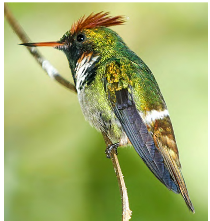
Figure 1. An adult male Lophornis magnificus (Vieillot, 1817), 2 August 2015, at the headquarters of Águas do Brilhante Private Reserve, Itajaí, Santa Catarina, Brazil.

The first records of the species were from 1–4 August 2015, when a single adult male was observed visiting the feeders. On these occasions some photographs were made with a Canon® EOS 5D Mark III (Figure 1; Weyermanns 2015). Subsequent observations of an adult male, presumably the same individual, were made on 15 September 2015, 25 January, 1 February, 20 March and 9 April 2016. The individual was always