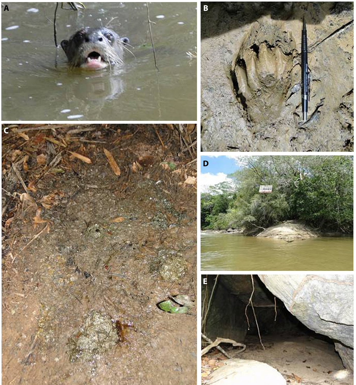
Figure 2. Direct and indirect sightings of Pteronura brasiliensis . A. Direct sighting of an adult individual in Estação Ecológica de Maracá. B–E. Indirect sightings: (B) footprint (scale represented by 15 cm pen), (C) latrine, (D) camp, and (E) burrow.

75% of the total distribution of the Pteronura brasiliensis , there are still gaps in the knowledge of this species' distribution in Brazil (Evangelista and Tosi 2015), confirming the importance of this study. Although there is great difficulty in observing P. brasiliensis in the Brazilian Amazon, particularly owing to the complex logistics in this region, this work presented the first record of this species in the lavrado ecosystem, an ecosystem of diverse non-forest vegetation types and the largest contiguous