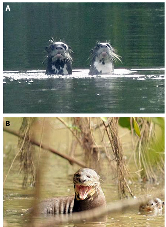
Figure 1. Pteronura brasiliensis in Estação Ecológica de Maracá (ESEC Maracá, Roraima) displaying alarm and territorial behavior. A. Two individuals exposing their heads and necks. B. One individual making repetitive noise.

Fifty-two new records of Pteronura brasiliensis were collected: 27 from direct sightings of individuals or groups and 24 from indirect sightings such as latrines, burrows, footprints, or camps (Figure 2). Of the total records, eight colleagues from the Instituto Chico Mendes de Conservação da Biodiversidade (ICMBio) provided 21 records, and another 31 records were collected during field expeditions undertaken by the authors of the present study.