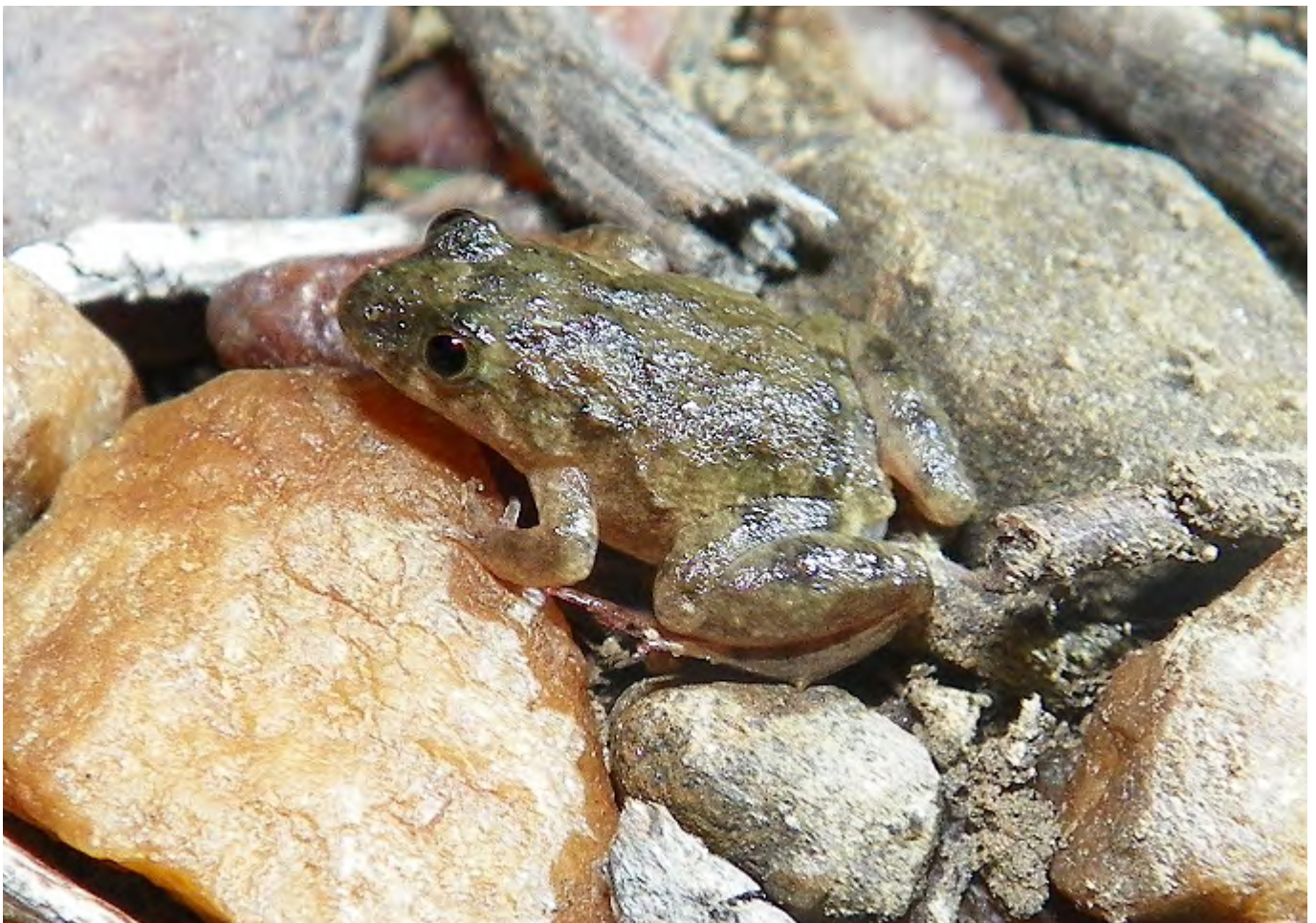
Figure 2. Adult male of Pseudopaludicola pocoto photographed in Cabrobó municipality, Pernambuco state, northeastern Brazil