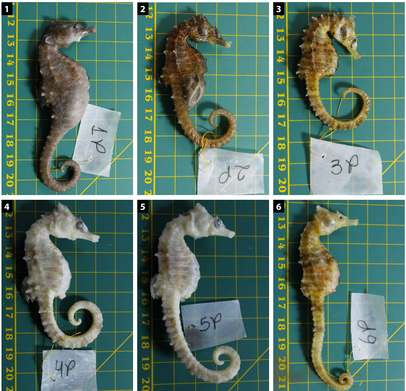
Figure 2. Individuals of Hippocampus patagonicus (MHNCI 12651) registered as bycatch in the shrimp trawl fishery in the coast of Paraná, southern Brazil. Recently fixed specimens (2, 3 and 6).

other species of the genus Hippocampus . All specimens closely resemble the description of H. patagonicus provided by Piacentino and Luzzatto (2004), González et al. (2014) and Silveira et al. (2014) (Figure 2), and counts and measurements were consistent with those reported by these authors (Table 2). Most of the characters provided by Piacentino and Luzzatto (2004) in the original description agree with those from the material examined. However, some differences in the following characters were observed (original description versus material examined herein): number of pectoral fin rays (12–14 versus 12–15), height range (21–103 versus 97–123 mm), proportion of snout/head length (2.43–3.47 versus 2.81–3.91), number of tail rings (37–41 versus 35–38),