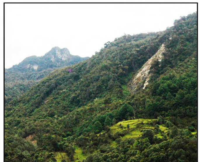
Figure 1. Dorsal and ventral view of Niceforonia adenobrachia (snout-vent length: 18.85 mm; voucher IAVH-Am-10322) and its forested habitat at El Porvenir, municipality of Córdoba, department of Quindío, Colombia.