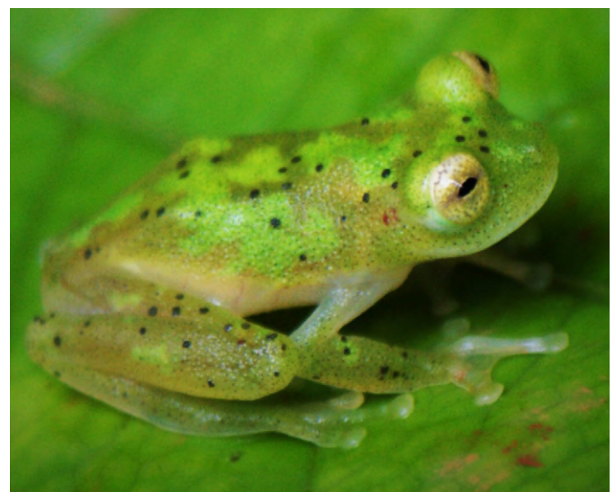
Figure 1. Adult male of Hyalinobatrachium iaspidiense (CECCAMPOS 00792, SVL = 20.9 mm) from the municipality of Serra do Navio, state of Amapá, Brazil.