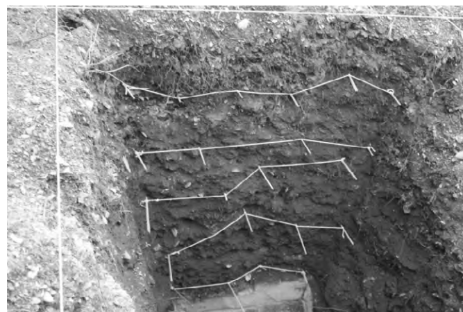
Figure 2. HS-A1-e sector of the Tarioba shell mound showing the five archaeological stratigraphic layers marked with strings.

Delayering of the soil was done by artificial 10 cm sections which revealed five archaeological stratigraphic layers (Figure 2). The layers were sequentially labeled from 1 (L1) to 5 (L5). Sediment was collected with mason's trowel, spatula, brush, and shovel and deposited in buckets. All material was sorted, packaged, labeled and sent to the Laboratório de Genética Marinha e Evolução, Universidade Federal Fluminense, where it