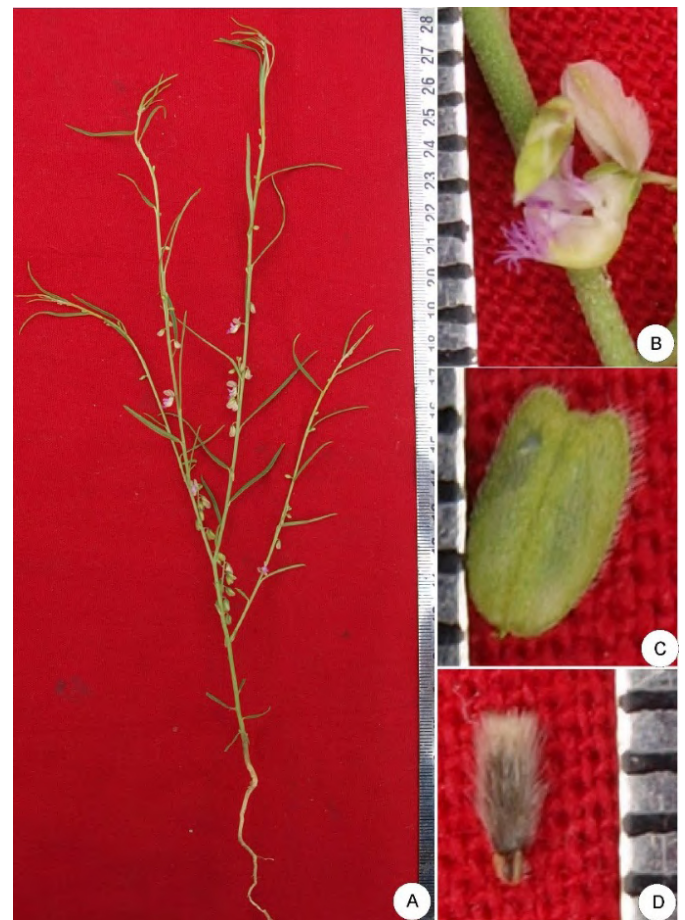
Figure 1. Polygala irregularis Boiss. from Hakrana village, Neemuch, Madhya Pradesh, India; Meena, M-249; Janjarwara village, P. Venu (BSI) 7528 (MLVGCB Herbarium). A: habit. B: flower. C: fruit. D: seed.

Annual, pubescent, 10–35 cm high, herb. Lower leaves obovate; upper leaves shortly petioled, 2–3.5 × 0.3–0.6 cm, linear-oblong, lanceolate, attenuate at base, retuse, obtuse, mucronate at apex, margins recurved, puberulous on both surfaces, coriaceous. Flowers in terminal and lateral racemes, purplish. Bracts deciduous. Sepals persistent, hairy; outer sepals linear-oblong