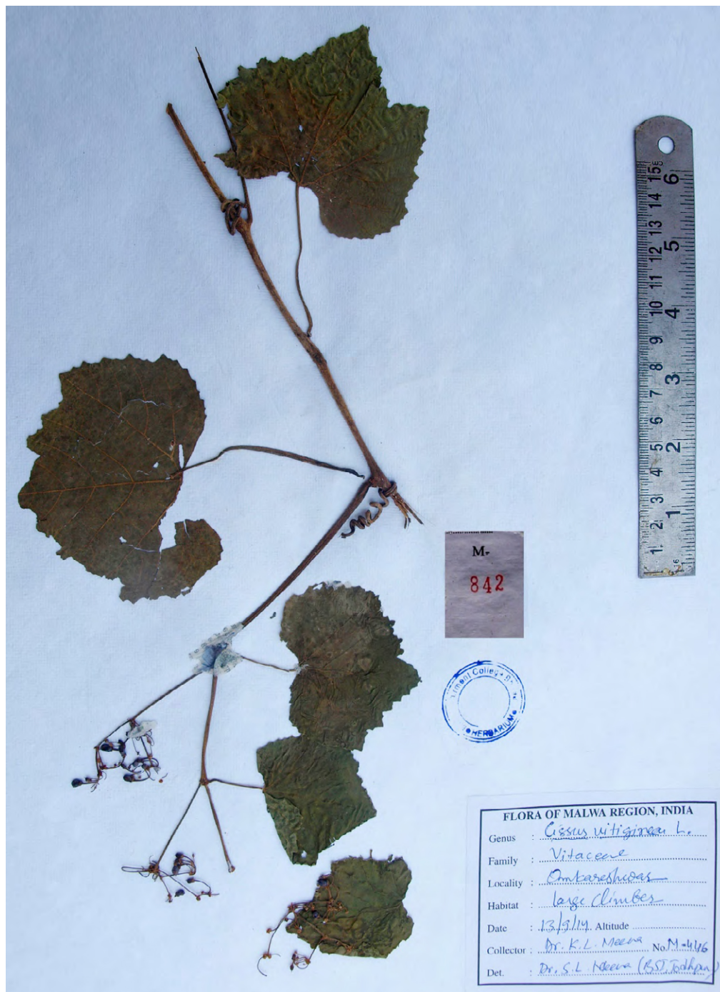
Figure 4. Herbarium sheet of Cissus vitiginea L., showing flowers and fruits. India: Madhya Pradesh: Khandwa: Omkareshwar; M-842 (MLVGC Herbarium).