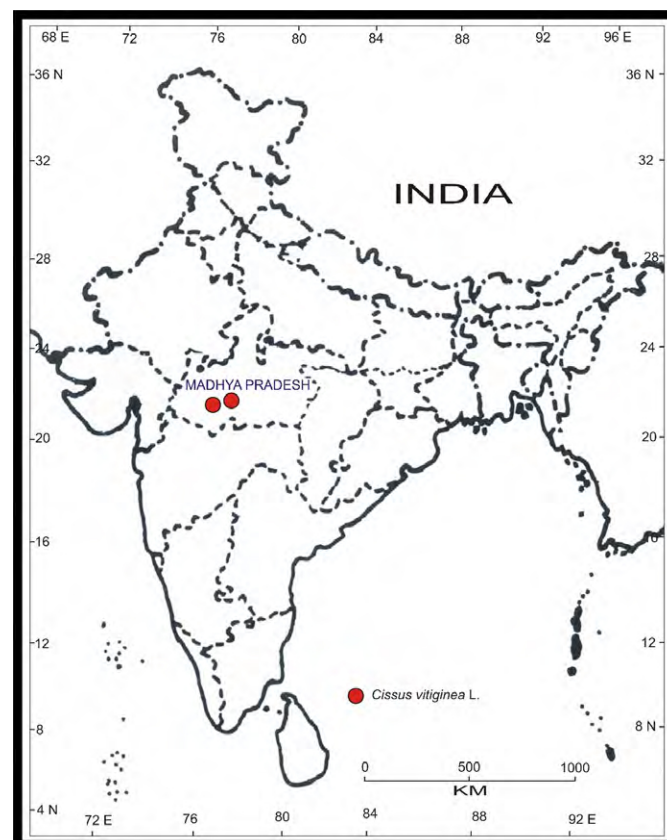
Figure 1. Distribution of Cissus vitiginea L. in Madhya Pradesh state, India.

Climbing, foetid shrubs. Branches subterete, striate, covered with short grey or fulvous pubescence, swollen at nodes. Tendril simple, sometimes bifid or branched. Leaves simple, rotund-ovate to deeply 3–5 lobed, 3.5–8 × 3–7.5 cm, base truncate to cordate, margin irregularly dentate, apex acute or obtuse, pubescent. Petioles 4–9 cm long, pubescent. Stipules triangular, pubescent. Inflorescence umbellate cymes. Peduncle 3–5 cm long.