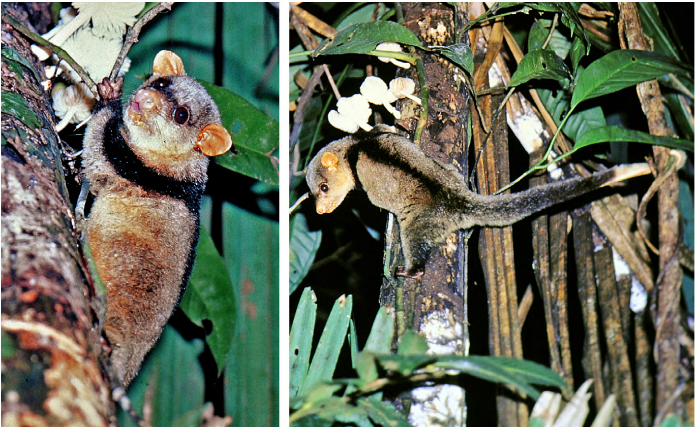
Figure 1. Photographs of a specimen of Caluromysiops irrupta taken at Parque Estadual Guajará Mirim, Guajará Mirim, Rondônia state (Locality 10, Figure 2), Brazil, in March 1995. The species can be easily identified on the basis of its distinctive fur pattern (see text for details).

to inner forearms and wrists, and joining along the mid-dorsum and running along the back, eventually fading to the overall fur color on the rump or along the tail (Emmons 2008; Astúa 2015). All these features are evident in the photographic records and are not found in any other didelphid species (Figure 1).