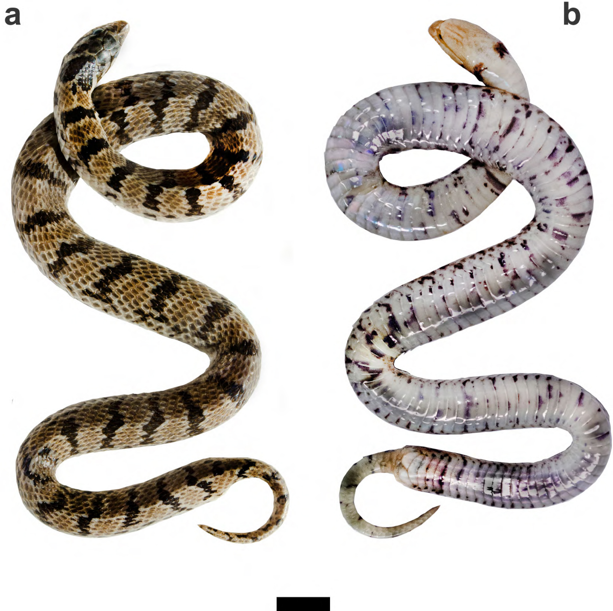
Figure 2. Dorsal (a) and ventral (b) views of specimen referred to Xenodon histricus (CFA-Re-450). Scale bar 30 mm.