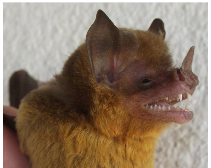
Figure 2. Specimen of Lamproncyteris brachyotis (RM 353) captured in Barra do Garças, state of Mato Grosso, Brazil.

The specimens were collected under the license no. 18276 (IBAMA) and are preserved in 70% alcohol in the scientific collection of the Nova Xavantina campus of Universidade do Estado de Mato Grosso (catalog numbers RM 353 and RM 361). They were identified based on their reddish coloration, forearm length, size and shape of ears and noseleaf, presence of two Y-shaped pads on lower lip, calcar length equal to foot length, and incisor characters (Vizotto and Taddei 1973; Mendellin et al. 1985; Williams and Genoways 2008; and Reis et al. 2013). External and cranial measurements (mm), taken as described by Vizotto and Taddei (1973), are as follows: forearm 42.2 and 42.9; greatest length of skull 20.8 and 20.9; condylocanine length 20.3 and 21.1; condylobasal length 20.7 and 21.4; maxillary tooththrow length 8.3 and