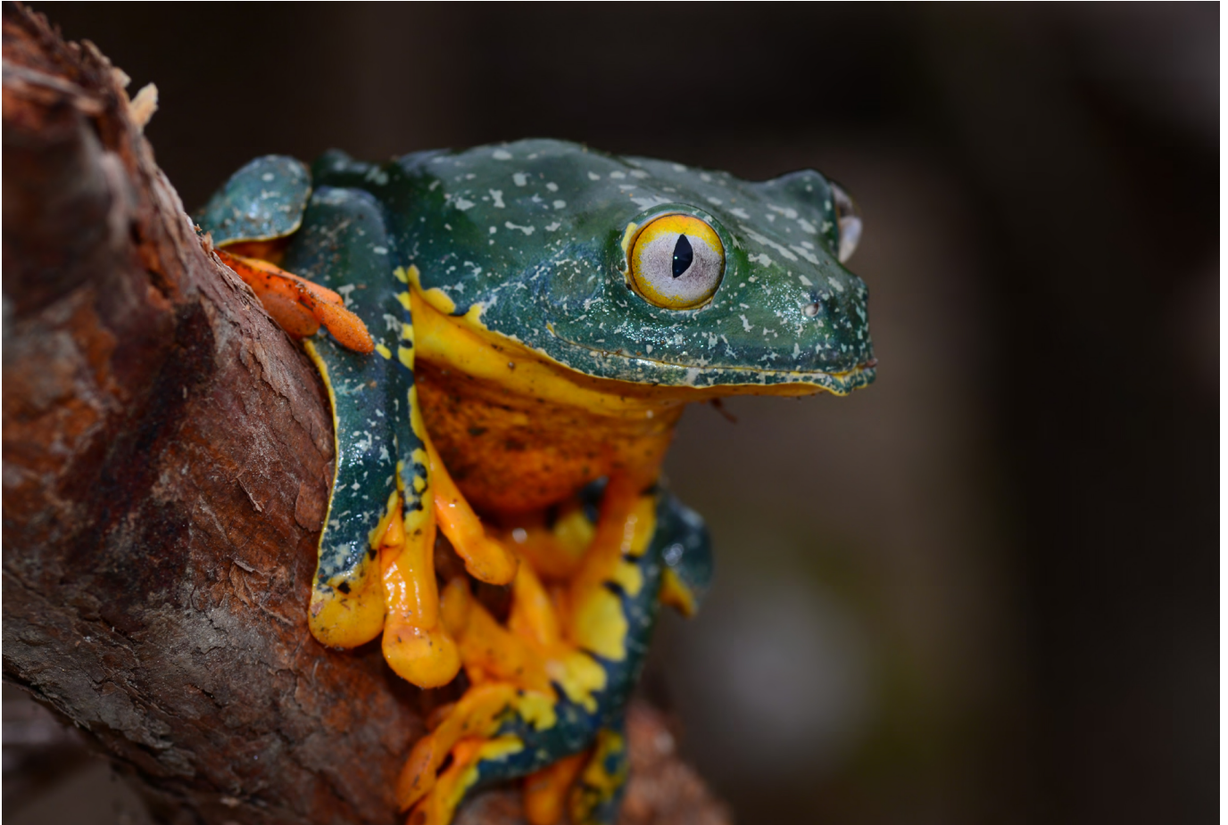
Figure 1. Adult female of Cruziohyla craspedopus DHMECN 11296, Snout-vent length 83.22 mm.

25,000 km 2 . Previously, Santiago in Morona Santiago province was the southern edge of this species' range in Ecuador (Hoogmoed and Cadle 1991).