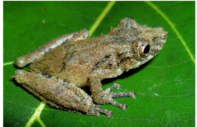
Figure 1. Live adult of Scinax nebulosus (Spix 1824) – LABEV A 859 (Photo by Rony P. S. Almeida).

Key words: Scinax , Atlantic Forest, State of Sergipe, Brazil