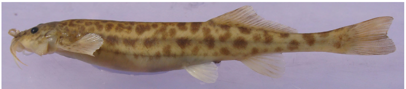
Figure 1. Hatcheria macraei , MCNI 1579, 60.6 mm SL, collected in Río Jagüé, Vinchina Department, La Rioja province, Argentina.

H. macraei is a macroinvertivore and nocturnal