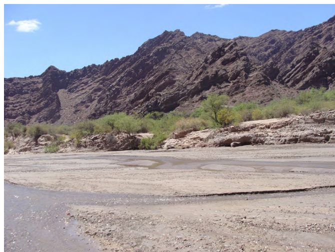
Figure 3. Habitat of Hatcheria macraei , Río Jagüé, upper Vinchina drainage, La Rioja province, Argentina.