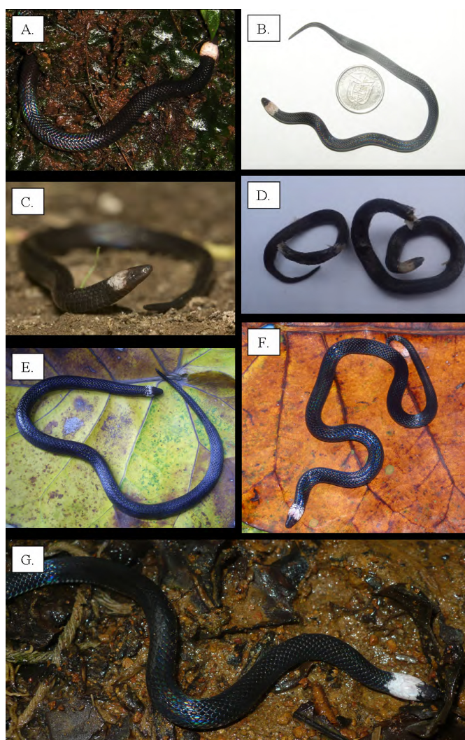
Figure 2. Photographs of various specimens of Geophis bellus included in this paper. A: UTADC 8066 from Parque Nacional Santa Fe, Veraguas province, B: MVUP-2135; Parque Nacional Portobelo, Province of Colón, C: UTADC 8085 from El Valle de Antón, Coclé province, D: MVUP-2136 in PNGDOTH, Coclé province, E: JMR931/UTADC 8069, in PNGDOTH, Coclé province, F: JMR937/UTADC 8068, in PNGDOTH, Province of Coclé, G: CH-9805; UTADC 8067 in Parque Nacional Chagres, Colón province.

On 20 October 2009 at 20:28 h AS, E. Toribio and D. Natera found a Geophis bellus (UTADC 8066; Figure 2A) on the Camino del Macho de Monte in Bajo del Palmar, El Pantano, PNSF, Veraguas province (08°34'12" N, 081°05' 24" E, 1100 m above sea level [a.s.l.]; Locality 5 on Figure 1). This is a range extension of ca. 201 km southeast into Veraguas province from the type locality. The area where the snake was collected is primary cloud