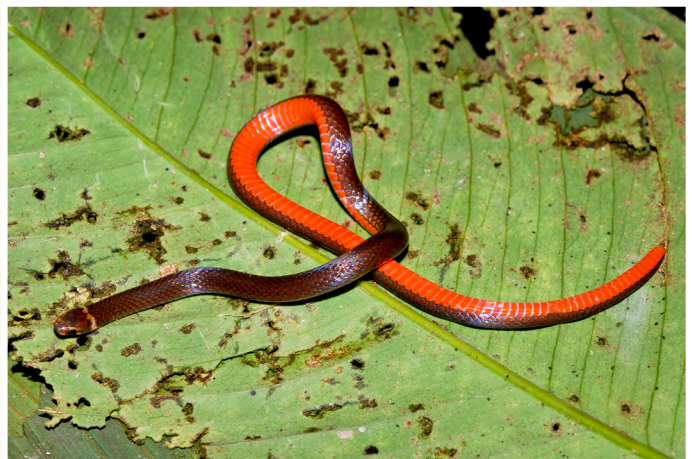
Figure 1. Collected specimen of Tantilla alticola from Valle del Cauca department, Colombia.