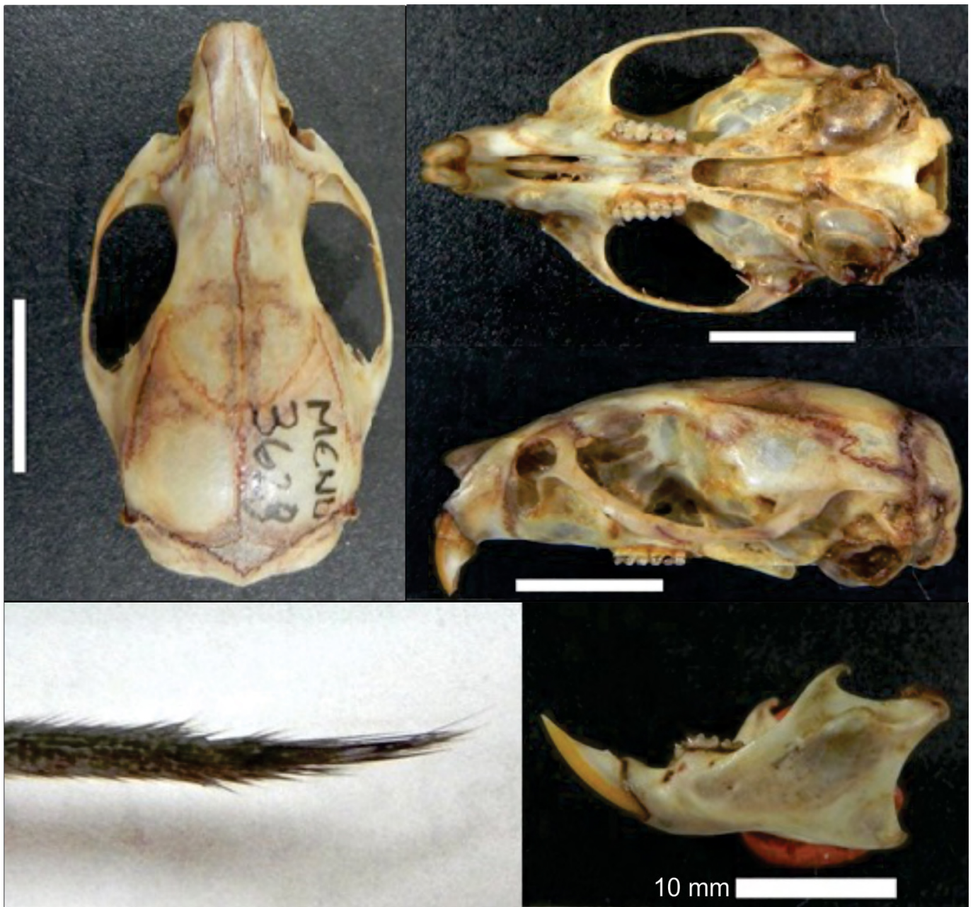
Figure 3. Abrawayaomys ruschii adult female MCNU3629 collected in Chapecó, Santa Catarina state, southern Brazil. Dorsal, ventral, and lateral views of the skull. On the bottom, left photo, the brush of hairs of the tail tip. On the bottom right, lateral view of the mandible. The scale bar (in white) in each photo represents 10 mm.