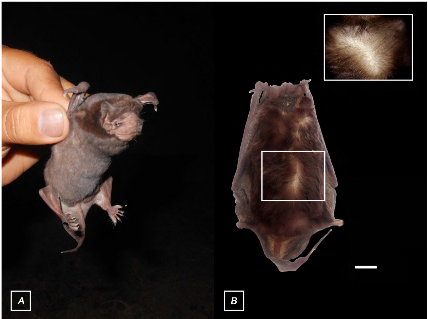
Figure 1. Specimen of Promops davisoni (MUSM 42359) collected in Pampa Alta, Ite, Jorge Basadre, Tacna, Peru. A. Live adult female after being captured with a mist net; B. Characteristics of pelage (dorsal view), a clear basal band that extends about half length of each hair is observed. Scale bar: 1 cm.

Tyto alba (Aves, Strigiformes, Tytonidae). In this study, we report the first record of P. davisoni for Tacna department, Peru and a southward extension from its known geographical distribution.