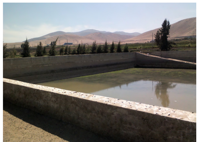
Figure 2. Surroundings of Pampa Alta locality and Agricultural reservoir where Promops davisoni (MUSM 42359) was collected.

was preserved in alcohol with the skull removed and deposited in the mammal collection of the Museo de Historia Natural de la Universidad Nacional Mayor de