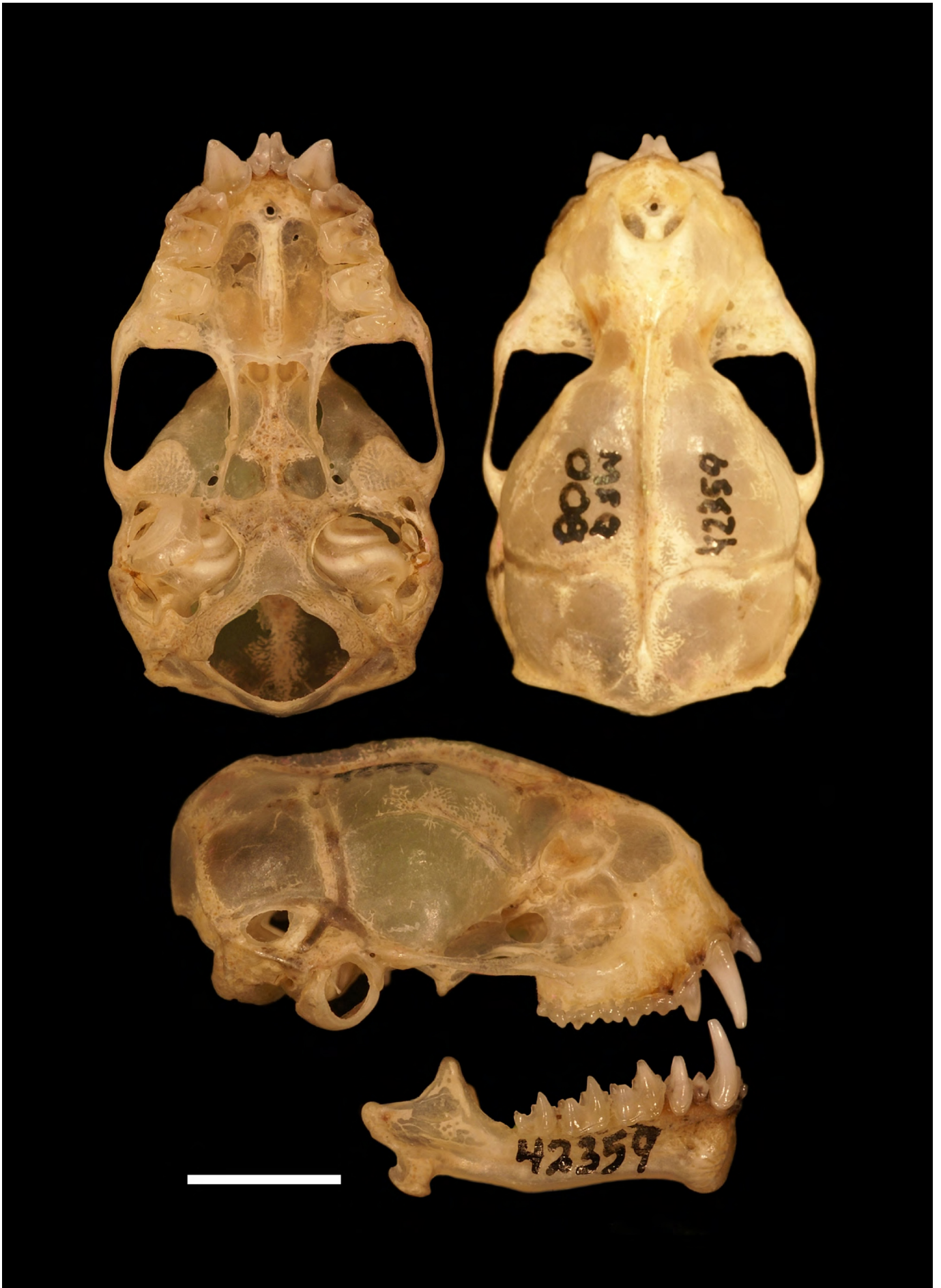
Figure 3. Ventral, dorsal and lateral views of the skull of Promops davisoni (MUSM 42359). Scale bar: 5 mm.