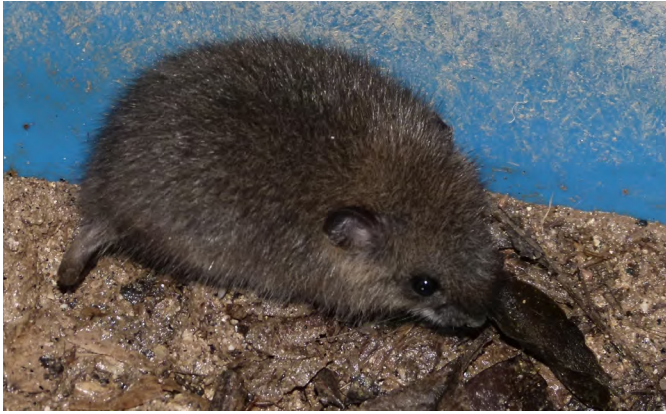
Figure 2. Young female of Drymoreomys albimaculatus (MN 81462) captured in a pitfall trap in Serra da Bocaina National Park, municipality of Paraty, RJ, Brazil.

On 13 January 2014, one young female of D. albimaculatus (MN 81462) was captured at Serra da Bocaina National Park (23°11'53.3" S, 044°50'34.4" W, Datum