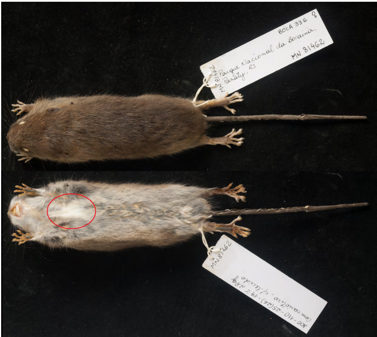
Figure 4. Dorsal and ventral views of the dried skin showing the white patches of fur in the gular and thoracic regions (red circle) of Drymoreomys albimaculatus (MN 81462) from Serra da Bocaina National Park, municipality of Paraty, RJ, Brazil.

In addition of D. albimaculatus , the use of pitfall traps in the study area proved to be useful to sample such rare species as Blarinomys breviceps (Winge, 1887) (see Delciellos et al. 2012), Juliomys rimofrons Oliveira & Bonvicino, 2002 (see Fonseca et al. 2013), Phyllomys spp., and Monodelphis spp. (present study). After the specimen captured in 2011 (Delciellos et al. 2012), other three specimens of B. breviceps were already captured in the study area. Three out of five specimens of Phyllomys spp. sampled in the study area were captured in pitfall-traps despite of its arboreal habits. This also seems to be the case of D. albimaculatus , although little is known about its ecology. The morphology of D. albimaculatus resembles that of the arboreal taxa in some aspects (e.g., very developed plantar pads), but it was previously captured almost exclusively in pitfall-traps (Percequillo et al. 2011). The capture of arboreal species in pitfall-traps has been recently reported for some species — e.g., Rhagomys rufescens