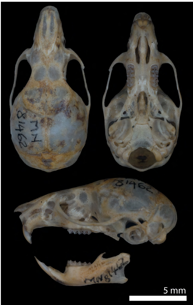
Figure 3. Dorsal, ventral, and lateral views of the skull, and lateral view of the mandible of Drymoreomys albimaculatus (MN 81462) from Serra da Bocaina National Park, municipality of Paraty, RJ, Brazil.

SAD69, elevation of 1,107 m), municipality of Paraty (Figure 1). The specimen was captured in a pitfall trap (Figure 2), in a mixed habitat of forest and bamboo. The young female (M3 occluded; Figure 3) measured 100 mm of head-body and 111 mm of tail lengths, with body mass of 28 g.