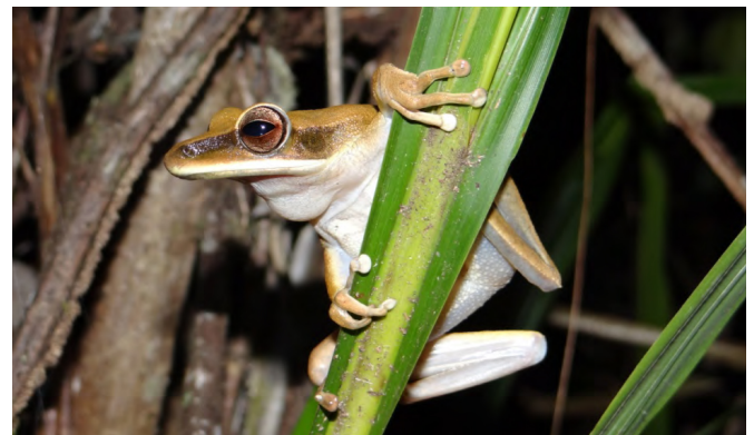
FIGURE 1. Adult Hypsiboas lanciformis (voucher specimen, male, snout-vent length SVL = 60.9 mm) from Ilha de Santana, municipality of Santana, Amapá state, Brazil.

The specimens were euthanized with 5% lidocaine gel, fixed in 10% formalin and preserved in 70% alcohol. Collections were made under license number 34220-2 issued by Ministry of Environment (MMA), Chico Mendes Institute for Biodiversity Conservation (ICMBio), Authorization System and Information of Biodiversity (SISBIO). The voucher specimens of H. lanciformis were deposited in the Herpetological Collection of the Federal University of Amapá (CECCAMPOS 00003; CECCAMPOS 00004; CECCAMPOS 00091).