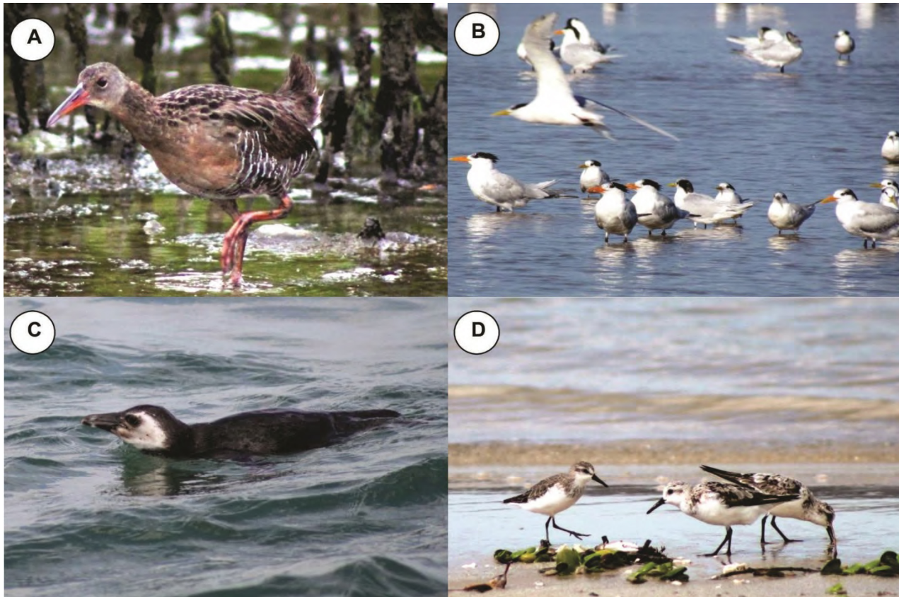
FIGURE 3. Some species photographed during our surveys that are regionally threatened and new to Estação Ecológica de Carijós in southern Brazil: A) Rallus longirostris Boddaert, 1783, vulnerable at the state level, at Pontal do Jurerê on 6 January 2012; B) Thalasseus maximus (Boddaert, 1783), vulnerable at the state and national levels, appearing in front of Thalasseus acutiflavus (Cabot, 1847) at Pontal do Jurerê on 13 November 2011; C) Spheniscus magellanicus (Forster, 1781) swimming in the Ratones Bay on 17 June 2012; D) Calidris pusilla (Linnaeus, 1766) (left) with two Calidris alba (Pallas, 1764) (right) foraging at the Pontal de Jurerê on 29 August 2012.

On 3 January 2011, another one rested in the intertidal zone together with Calidris alba . In that same year, four individuals were found foraging with Numenius phaeopus (Linnaeus, 1758) on 18 November (Figure 4B).