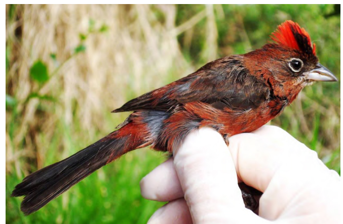
FIGURE 2. Adult male of Coryphospingus cucullatus (Statius Muller, 1776) banded (F24918) in the Station's headquarters of Estação Ecológica de Carijós, Santa Catarina Island.

Other bird studies along Brazilian coastline focused on inventorying the avifauna in restingas , mangrove