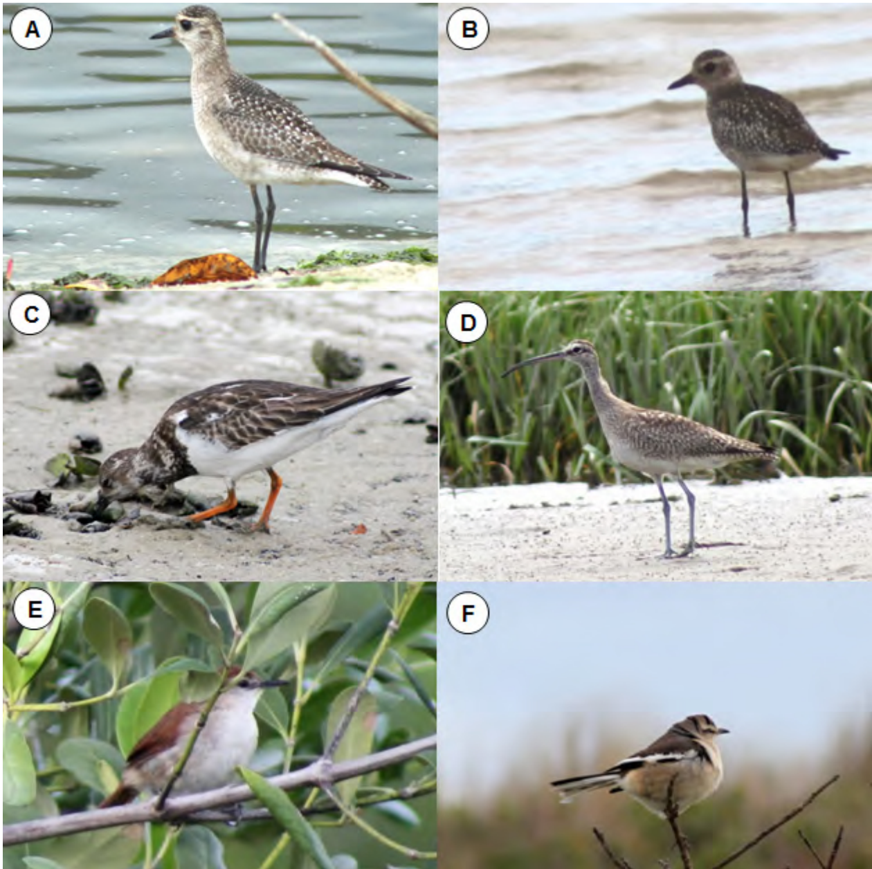
FIGURE 4. New species to Estação Ecológica de Carijós, southern Brazil, photographed during our surveys: A) Pluvialis dominica (Statius Muller, 1776) at Pontal de Jurerê on 27 November 2011; B) Pluvialis squatarola (Linnaeus, 1758) at Pontal de Jurerê on 18 November 2011; C) Arenaria interpres (Linnaeus, 1758) foraging at Pontal de Jurerê on 14 November 2012; D) Numenius phaeopus (Linnaeus, 1758) at Pontal de Jurerê on 18 November 2011; E) Certhiaxis cinnamomeus (Gmelin, 1788) at Station's headquarters on 2 January 2011; F) Mimus triurus (Vieillot, 1818) at Antiga Estrada da Daniela on 9 September 2012.