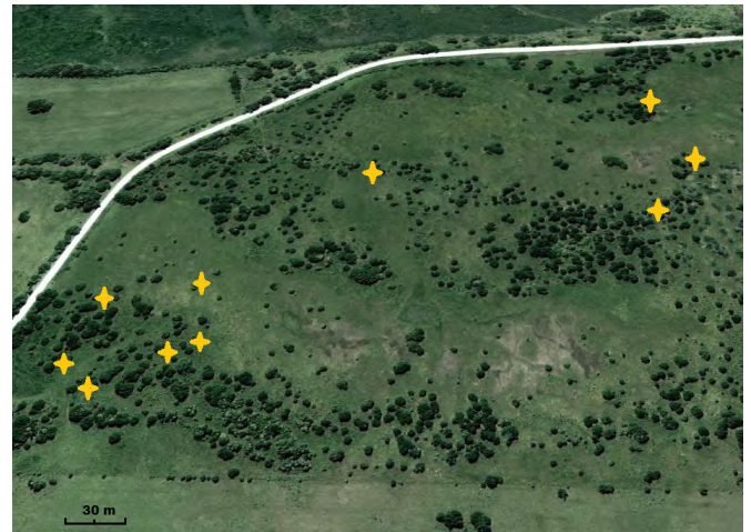
FIGURE 2. Image from Google Earth™ (28 January 2014) of the study area in the Estancia La Matilde, (Buenos Aires, Argentina) showing the location of specimens of Crataegus monogyna .

The present study reports the first record of C. monogyna to Buenos Aires province in central-eastern Argentina, and extends its distribution within southern South America. From the number of specimens found, their sizes, and their specific location within the forest (Figure 2), a possible hypothesis on the origin of these trees could be natural reproduction, although we did not find any seedlings growing in the study area. However, Valek (1980) suggested that the way in which favorable conditions for seedling establishment by Crataegus individuals tend to be very localized both in time and space (erosion surfaces, abandoned agricultural land),