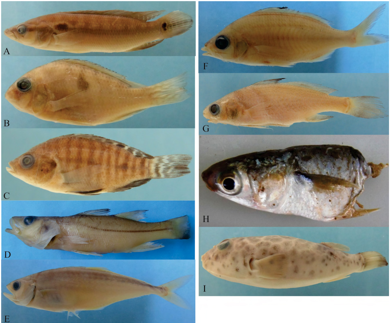
FIGURE 3. A, Crenicichla menezesi CZDP 011, 91.9 mm SL; B, Geophagus parnaibae CZDP 021, 54.1 mm SL; C, Oreochromis niloticus CZDP 012, 34.4 mm SL; D, Centropomus undecimalis CZDP 041, 131.5 mm SL; E, Oligoplites palometa CZDP 044, 98.4 mm SL; F, Eucinostomus melanopterus CZDP 042, 95.3 mm SL; G, Ophioscion punctatissimus CZDP 043, 89.9 mm SL; H, Mugil sp. CZDP 048, 30.8 mm HL; I, Sphoeroides testudineus CZDP 046, 100.6 mm SL.

was found almost destroyed in the gillnet, probably preyed on by another fish.