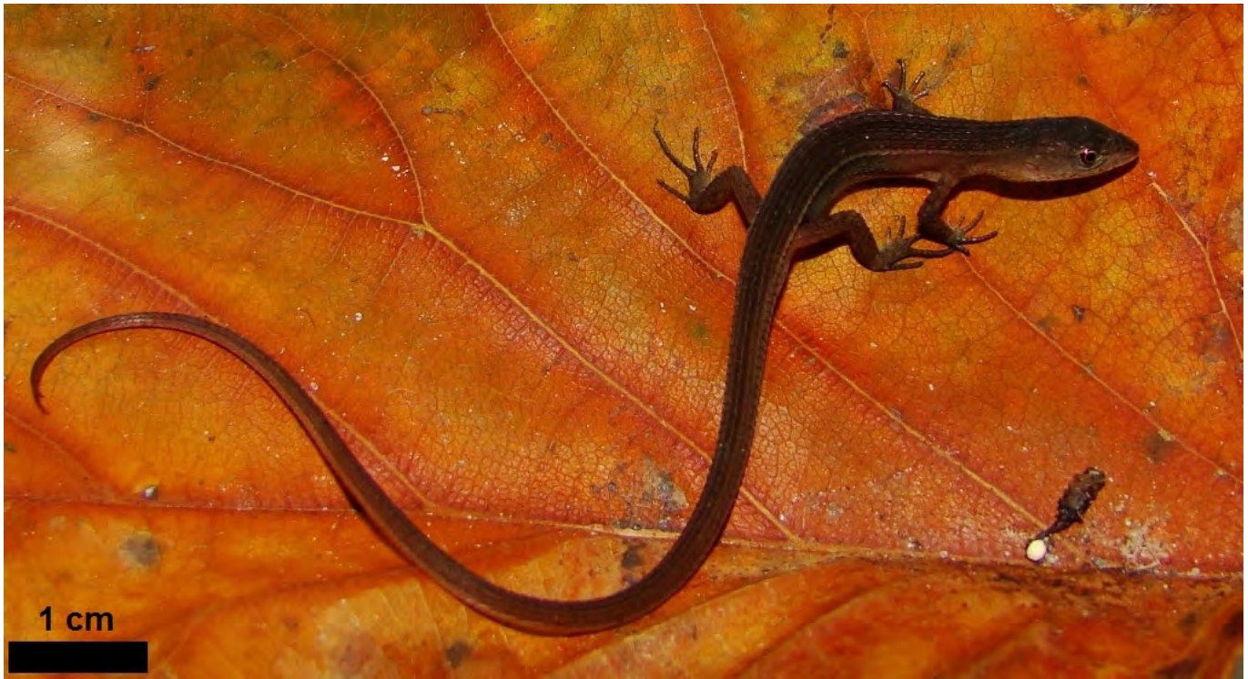
FIGURE 2. Individual of Cercosaura ocellata (CHBEZ 3984; SVL = 30.4 mm) collected in Centro Tecnológico de Aquicultura, Extremoz municipality, state of Rio Grande do Norte, Brazil.

Ruibal (1952) as northeastern South America, although the precise location is unknown. Despite that, there are only four accurate records in the literature for the species in northeastern Brazil, in the states of Maranhão (Ávila-Pires 1995), Ceará (Borjes-Norjosa and Caramaschi 2003), Pernambuco (Oliveira and Moura 2013) and Bahia (Couto-Ferreira et al. 2011).