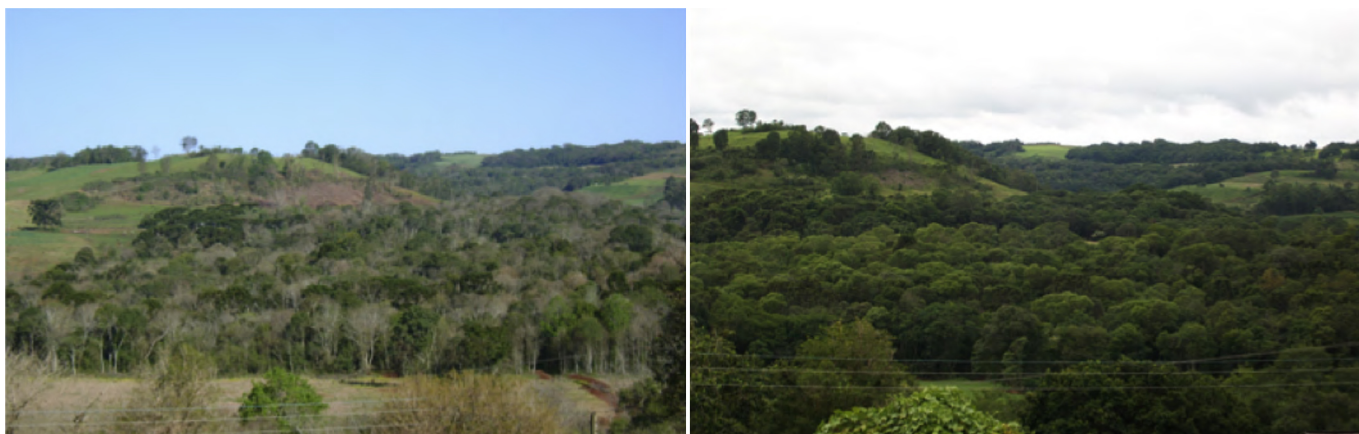
Figure 1. Images of the studied site, located in the municipality of Guaraciaba, Santa Catarina state, in the colder season (left) and in the warmer season (right).

The soils in the west portion of the state of Santa Catarina are remarkable for their fertility (“Terra Roxa”, Rhodic Nitisol), and the native pines were strongly exploited because of its wood. Therefore, the region saw intensive forest devastation during its colonization, as in the “Constestado War” in the early twenty-century, and the establishment of several small agricultural properties allocated on chemically and physically degenerated soils (Andreola et al. 2000).