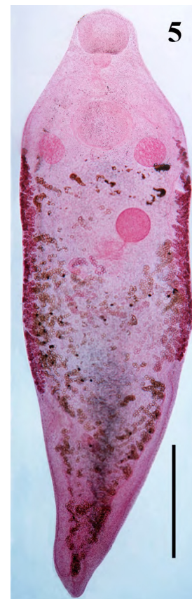
Figure 5. Lubens lubens . Entire worm, ventral view. Scale bar = 1 mm.

Description: (based on 2 specimens) Body oval to elongate oval; tegument with small papillae. Oral sucker subterminal, rounded. Ventral sucker well developed, slightly larger than the oral sucker, situated in anterior third of the body. Pharynx, globular. Oesophagus short. Caeca long and wide, reaching posterior end of body. Genital pore median, at level of posterior border of pharynx. Cirrus sac small. Testes intercaecal, rounded, approximately equal in size, symmetrical. Ovary dextral, rounded, located behind testes and separated from them by loops of uterus. Seminal receptacle and Laurer's canal present. Mehlis' gland diffuse. Vitelline bands composed of numerous follicles occupying caecal and extracaecal regions from posterior border of ventral sucker or anterior margin of testes. Uterus occupying all available space of hindbody; eggs operculated. Excretory vesicle not seen. Excretory pore terminal.