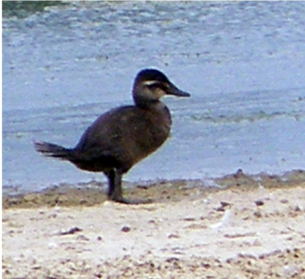
Figure 1. Oxyura vittata recorded in a salina in the Nhecolândia subregion of the Pantanal in the 2009 winter.

observed among a flock of Red Shovelers ( Anas platalea Vieillot, 1816) while foraging and swimming in a brackish pond, locally known as “salina” (see Medina-Júnior and Rietzler 2005).