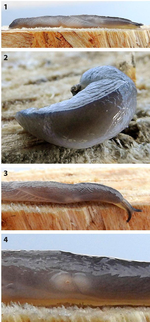
Figures 1–4. Boettgerilla pallens (NFM MO-2078). 1. Lateral view, in extended, normal crawling position. 2. A contracted specimen showing the dorsal keel. 3. Semi-dorsal view, in extended, normal crawling position, showing the drawn-out and pointed posterior margin of the mantle, and the groove on the right side of the mantle running forward and backward from the top of the pneumostome, instead of forming a broad U-shape as in milacids. 4. Showing the characteristic pneumostome area.

Boettgerilla pallens Simroth, 1912. Figures 1–4.