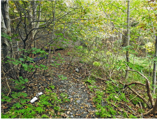
Figure 5. Habitat of the Newfoundland locality of Boettgerilla pallens .

almost exactly 5000 km within the Americas (Fig. 6). All 4 specimens were deposited in the mollusc collections of The Rooms Provincial Museum (Newfoundland and Labrador) (NFM MO-2078).