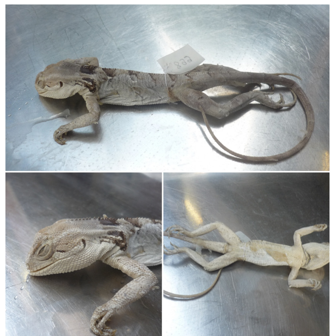
FIGURE 1. Specimen of Enyalius bibronii (CHP-UFRPE 899) collected in Teotônio Vilela, state of Alagoas, Brazil.

This report represents the first record of this species