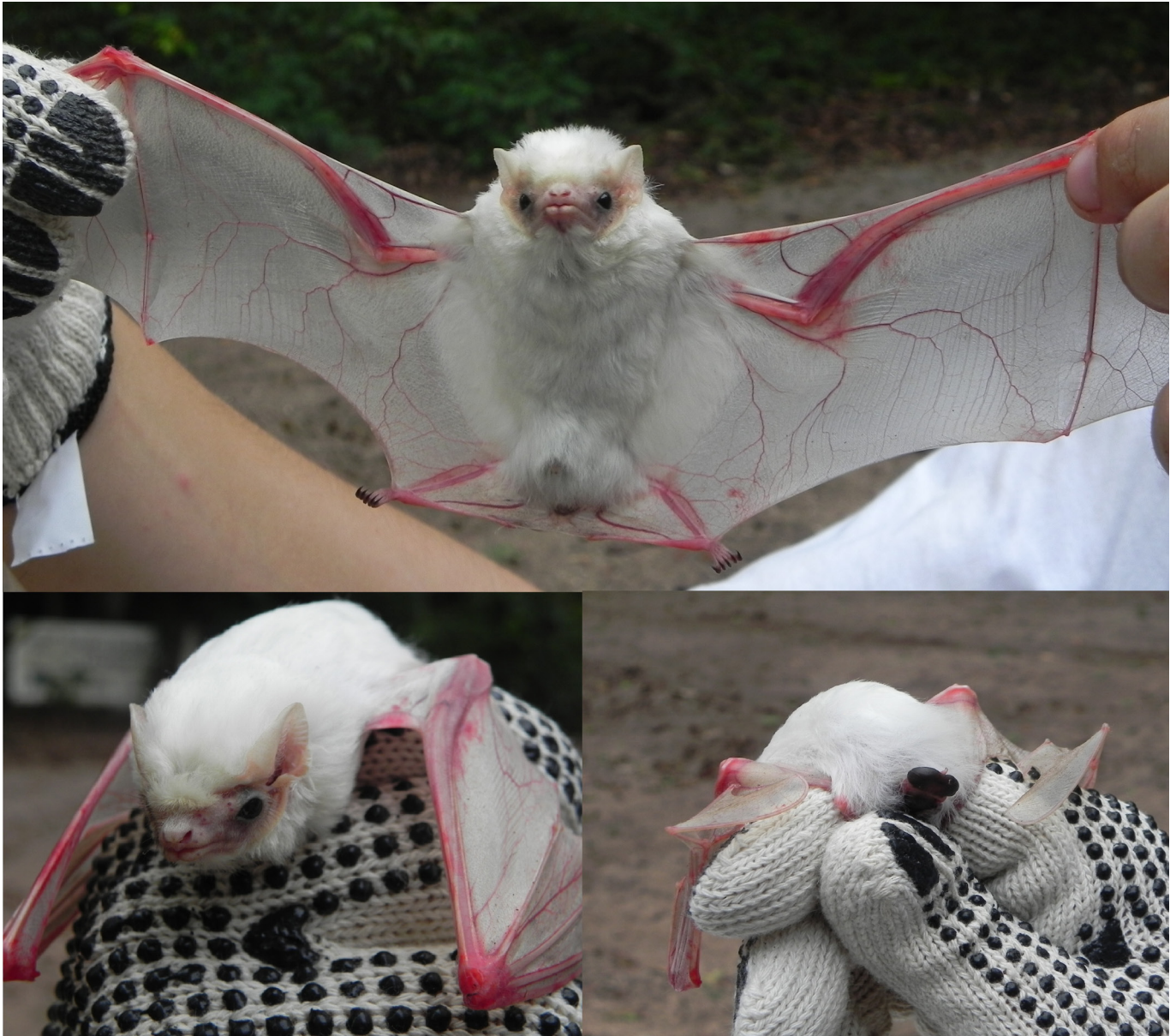
FIGURE 2. Live photograph of an adult female of Diclidurus albus captured in the Atlantic Forest fragment of Reserva Biológica Guaribas – SEMA 3.