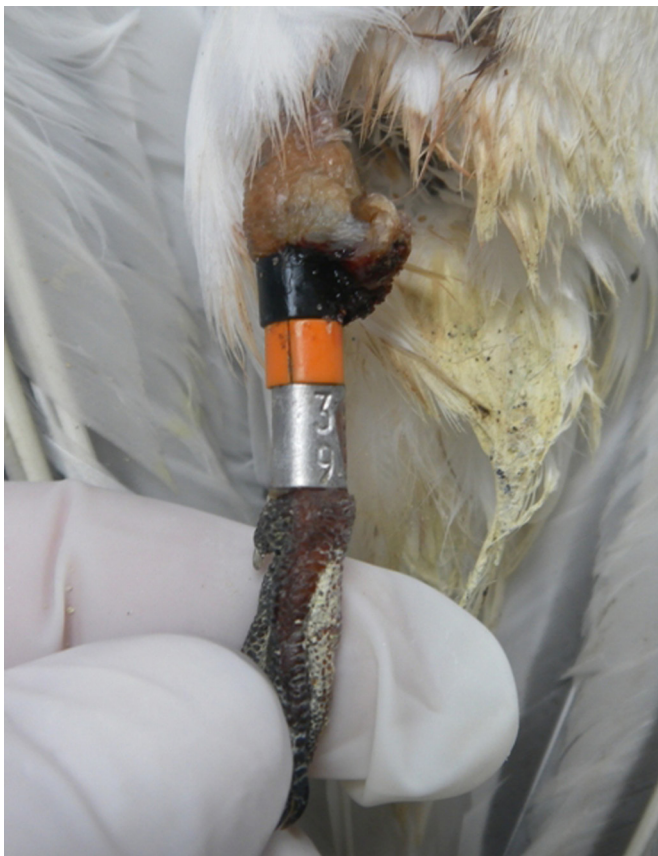
FIGURE 2. Leg injury of the Sterna dougallii specimen (OCE 66) found in the northern coast of Rio de Janeiro state, southeast Brazil.

It should be mentioned that the bird had an inflammatory injury in the right tarsus (Figure 2), possibly caused by the band, which was placed perhaps too tightly. This chronic adverse situation may cause swelling, loss of toe function, as well as impairing or interrupting of blood flow (Fair et al. 2010). The combination of plastic and metal bands placed in the same leg, as observed in the captured tern, may increase the likelihood of injury (Sedgwick and Klus 1997). As an additional effort to investigate the cause of death of this tern, oral and cloacal bacteriological tests to detect the presence of families Aeromonadaceae and Vibrionaceae were carried out in the National Reference Laboratory for Bacterial Enteroinfections (LRNEB; IOC/Fiocruz), with negative results. These microorganisms