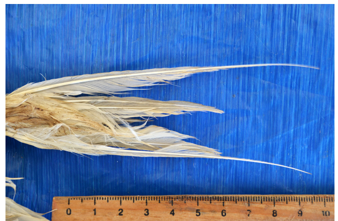
FIGURE 3. Tail of the Sterna dougallii specimen (OCE 66) found in the northern coast of Rio de Janeiro state, southeast Brazil, showing the white external rectrices.

The present record of S. dougallii in the southeastern Brazilian coast stretches its known distribution range in South America, and the importance of the recent beach monitoring efforts to detect species of unknown occurrence in southeast Brazil (e.g. Tavares et al. 2012a). Furthermore, we recommend the inclusion of this species in the primary bird list of Rio de Janeiro state (Gagliardi 2011).