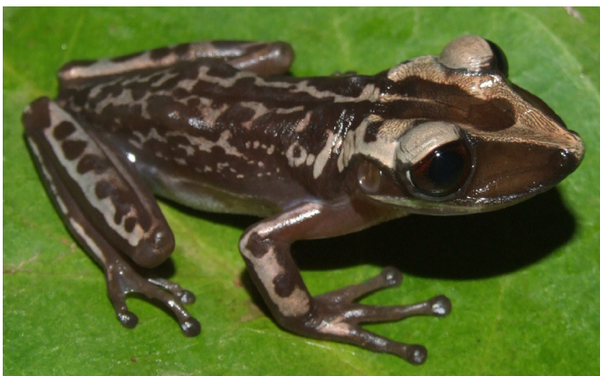
FIGURE 1. Adult male of Aparasphenodon brunoi from the municipality of Ilhéus, state of Bahia, Brazil.

The specimens were euthanized with lidocaine 2% (Xylocaína®), fixed in 10% formalin and preserved in 70% ethanol, and deposited in the Coleção de Anfíbios da Universidade Estadual do Sudoeste da Bahia, Vitória da Conquista (UESB) and Museu de Zoologia da Universidade Estadual de Santa Cruz (MZUESC). The collecting permit was issued by the Instituto Chico Mendes de Conservação da Biodiversidade (ICMBIO) (Permanent License 13708-1 and 12394-2).