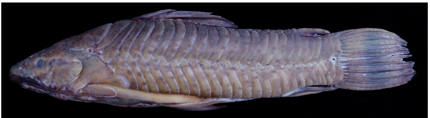
FIGURE 1. Specimen of Megalechis picta , NUP 8787, 170.0 mm SL, collected in Corumbá IV Reservoir.

The unique specimen of Megalechis picta (Figure 1) was collected by Roberto Leandro da Silva (Systema Naturae Consultoria Ambiental), 12/15/2006, in the Corumbá IV Reservoir, at the Rio Corumbá, tributary to the Rio Paranaíba, geographic coordinates 16°18'48" S, 48°11'39" W, upper Rio Paraná basin, State of Goiás, Luziânia municipality, and hosted in the Coleção Ictiológica do Nupélia, NUP 8787, 1, 170.0 mm of standard length (SL), available at: http://peixe.nupelia.uem.br . The species identification was performed following Reis et al. (2005). A map with the record of M. picta at the upper Rio Paraná basin is provided (Figure 2). Fishes were collected with permission of the Agência Goiana de Meio Ambiente – nº 40/2006.