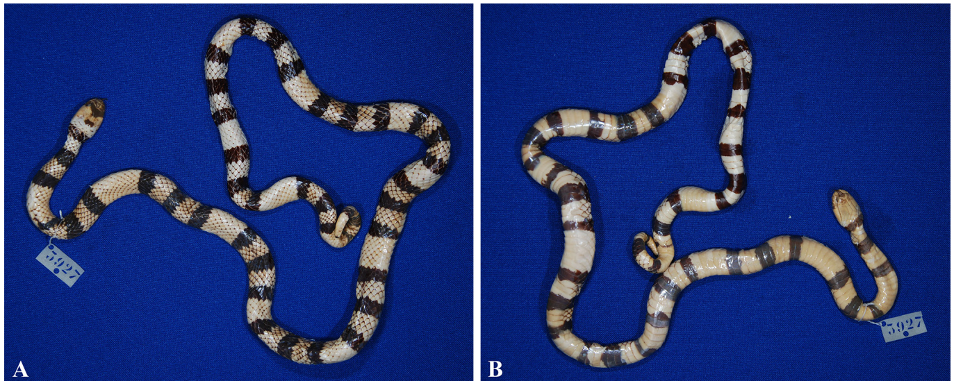
FIGURE 3. Dorsal (A) and ventral (B) views of the body of Micrurus isozonus (MNHN 0.3927) from Cartagena, department of Bolívar, Colombia (SVL: 640 mm; TL: 54.5 mm).

distributional information in a very poorly-known region, in the state of Roraima, northern Brazil. The Colombian record extends the known range of M. isozonus about 400 km west from the closest known record, in Venezuela. We confirm the species occurrence in Brazil offering vouchers and precise coordinates, and the three additional localities in Brazil slightly expand southward (about 100 km) the known distribution in the country. Overall, our records are located out of the Orinoco river basin, different than most of previous records. This paper help to elucidate the real distribution of M. isozonus , which should be the framework to propose priority areas to conserve this species.