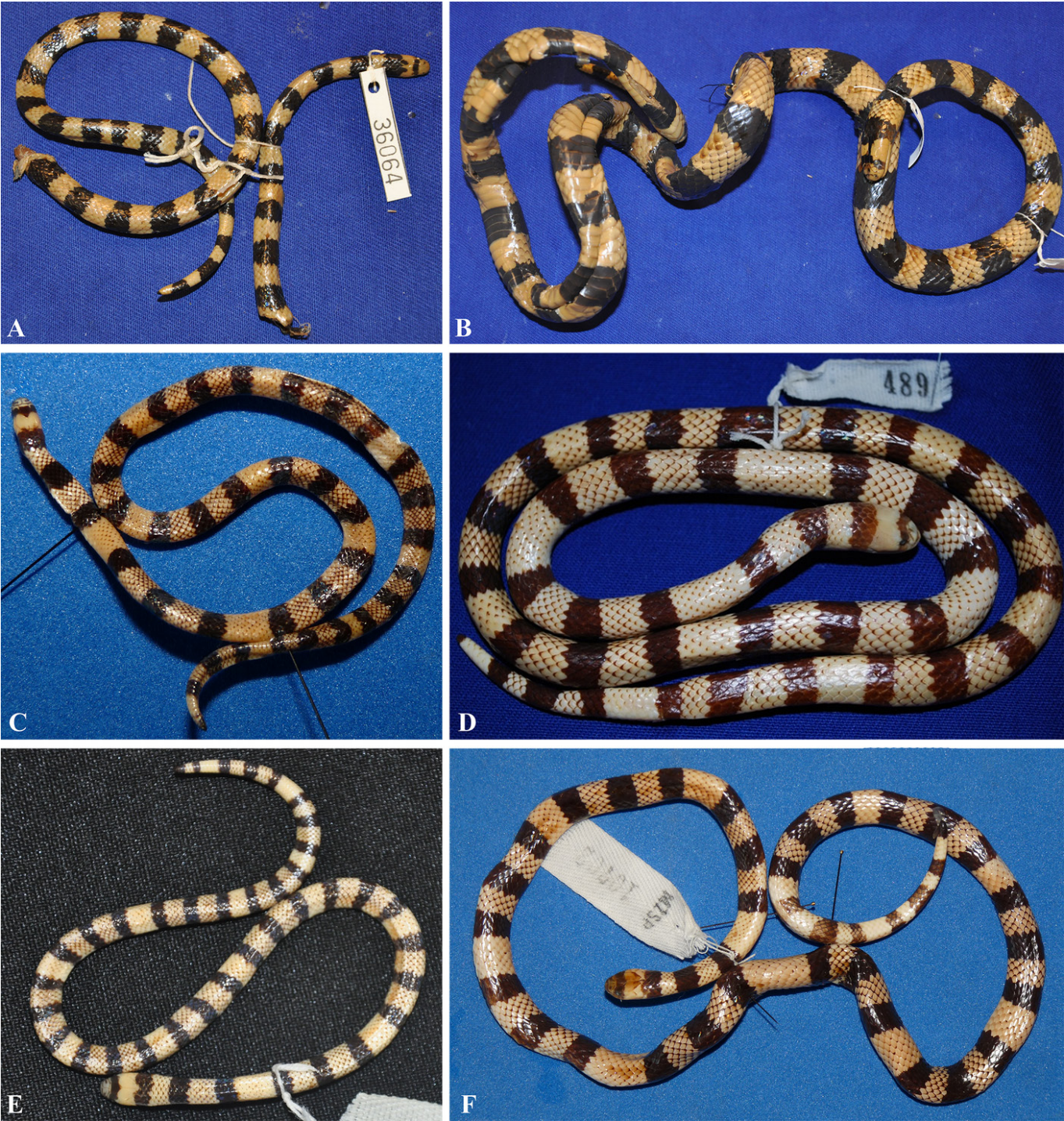
FIGURE 2. Dorsal view of the specimens of Micrurus isozonus examined: AMNH 36064 (A), AMNH 36066 (B), MZUSP 9181 (C), MPEG 489 (D), MZUSP 9180 (E), and MZUSP 10702 (F) (Photos: D. T. Feitosa; M. G. Pires).